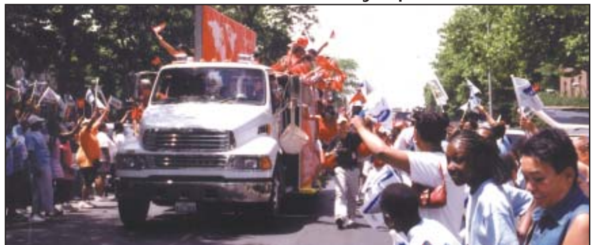
UNITING THE WORLD —NYCHA staff and residents from every borough turned out on June 19th for the Athens 2004 Olympic Global Torch Relay to cheer 140 torchbearers as they made their way through the City. The Olympic Torch was lit in Athens, Greece on March 25th, and will pass through 34 cities and 27 countries before returning to Athens in time for opening ceremonies on August 13. Shown here are residents and other well-wishers on Myrtle Avenue in Brooklyn, in front of Tompkins Houses.