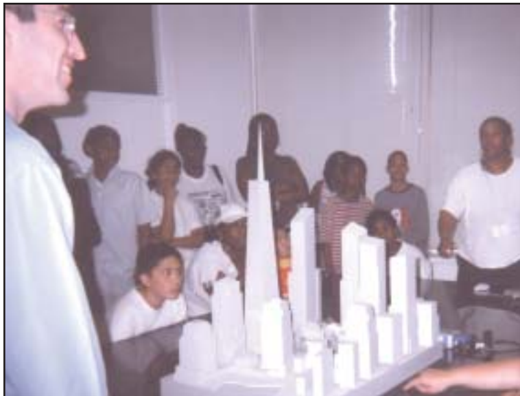
REFLECTING ABSENCE Former NYCHA architect Michael Arad, winner of the WTC Memorial Design Contest, shows young residents a model of the buildings planned for the site of the former World Trade Center.