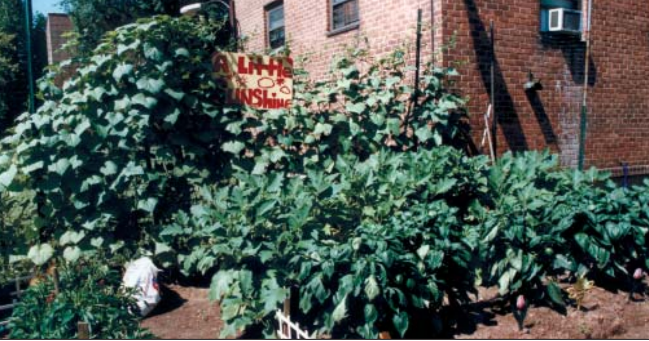
2003 Citywide Children's Theme Winner "A Little Sunshine Garden" Mariner's Harbor, Staten Island