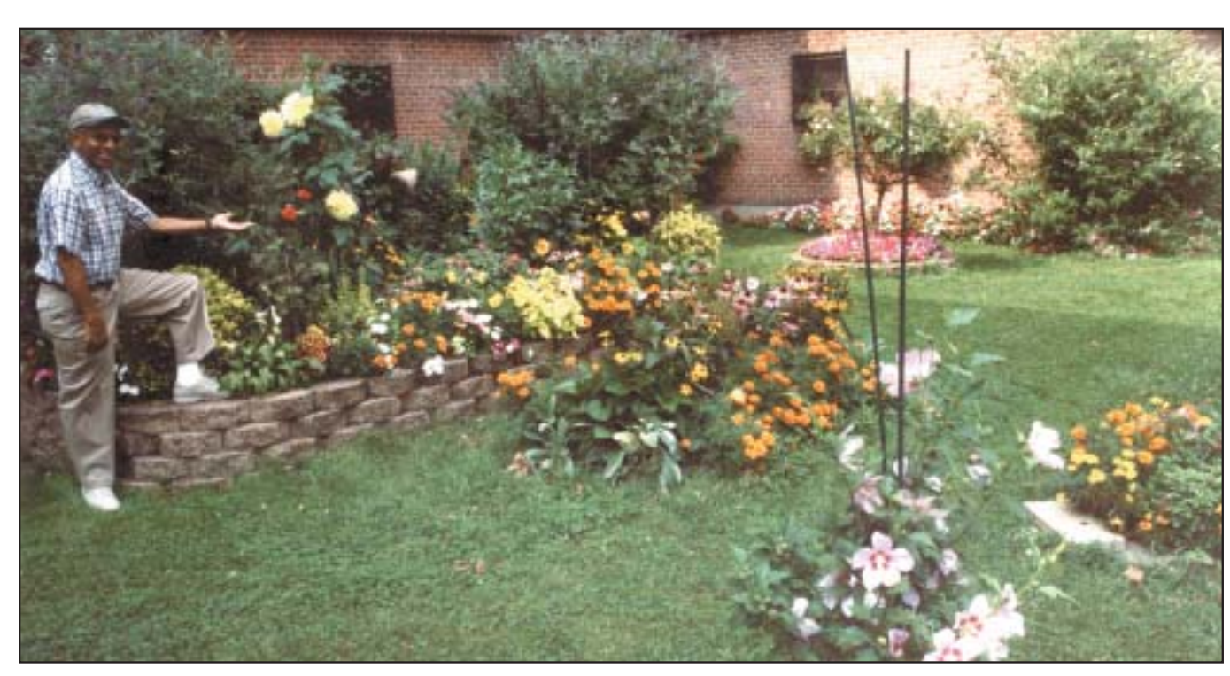
2003 Citywide Flower Garden Winner "Renew Your Spirit Garden" Sheepshead-Nostrand Houses, Brooklyn South

Para averiguar como puede usted participar, por favor llame al (212) 427-6648.