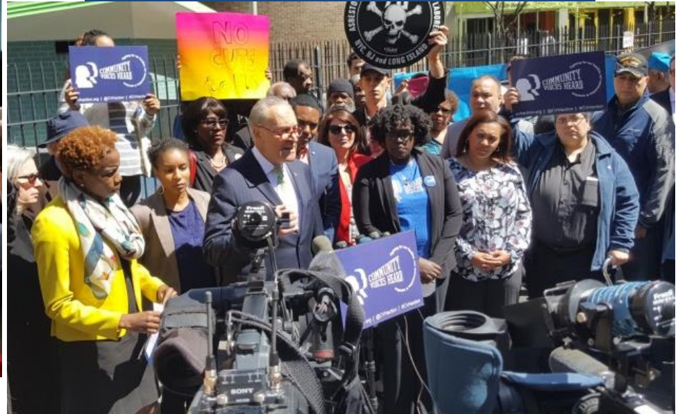
NYCHA Chair Olatoye with Senator Schumer and advocates at the #NoCutsCoalition press conference – April 18