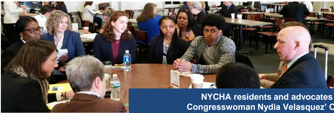
NYCHA residents and advocates meet with Congresswoman Nydia Velasquez' Office – April 4