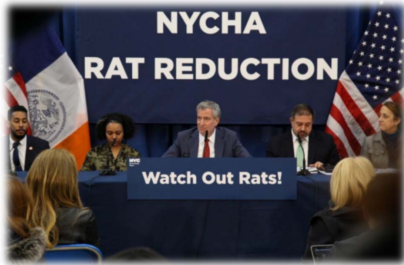
Mayor de Blasio's Rat Reduction Plan announcement on April 17, 2018

Mayor de Blasio announced NYCHA's ten (10) most infested developments will receive dry-ice abatement treatments, full time exterminators and new trash bins as part of the Mayor's Neighborhood Rat Reduction Plan.