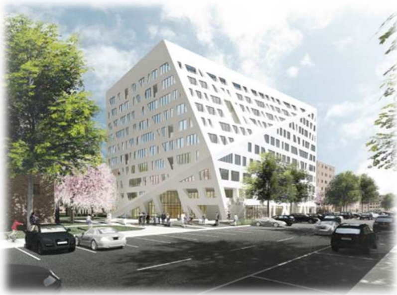
Rendering of the Sumner Houses Senior Building, courtesy of the Architect, Studio Libeskind

NYCHA, HPD, and HDC announced new partnerships under its 100% Affordable Housing program, its NextGen Neighborhoods program, and its FHA Vacant Homes program. NYCHA expects to generate over $40 million .