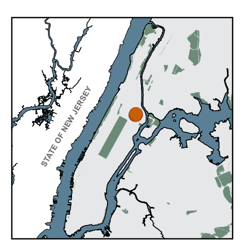
Prepared by: NYCHA Performance Tracking & Analytics Department