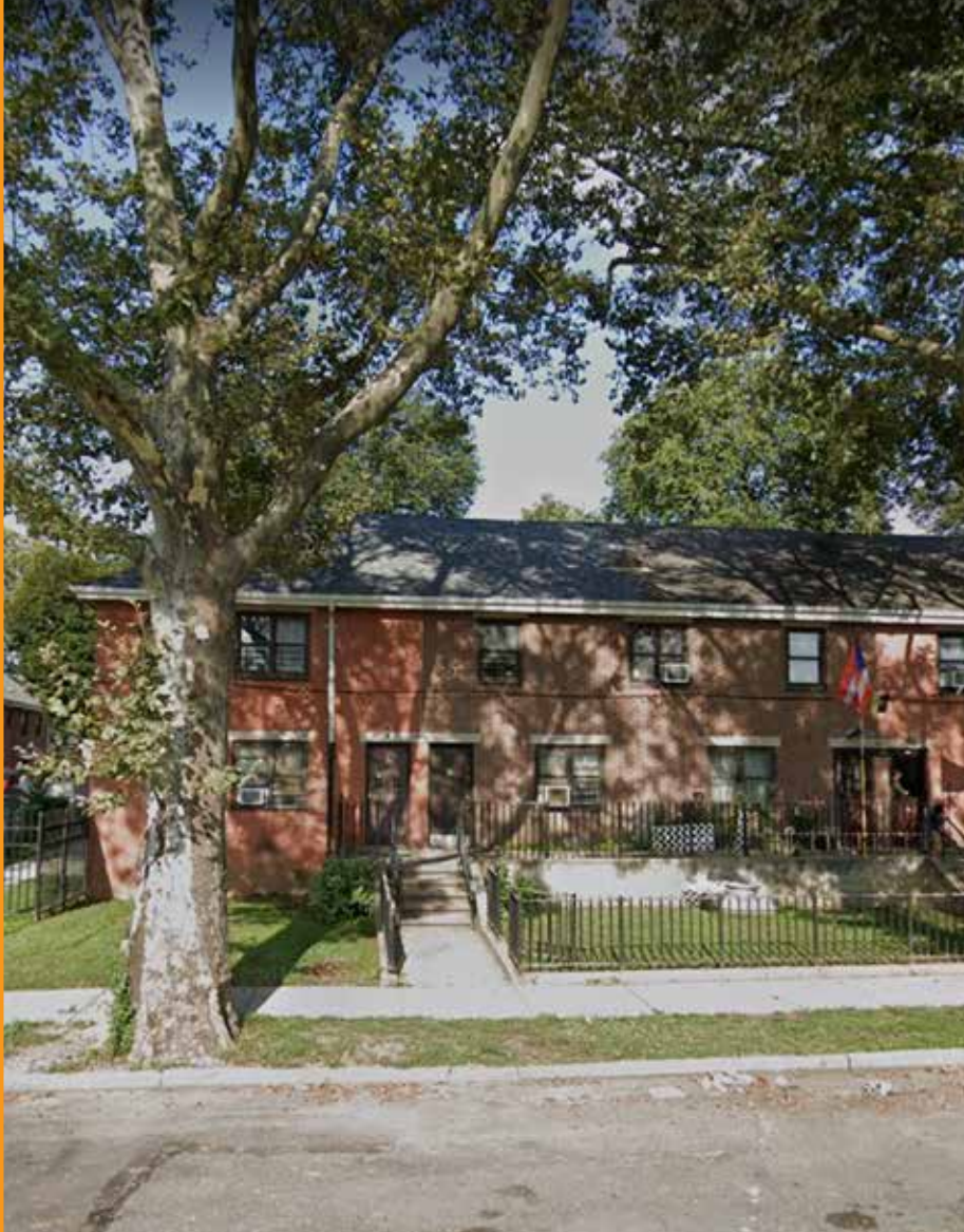
826 Metcalf Ave. - Clason Point Gardens