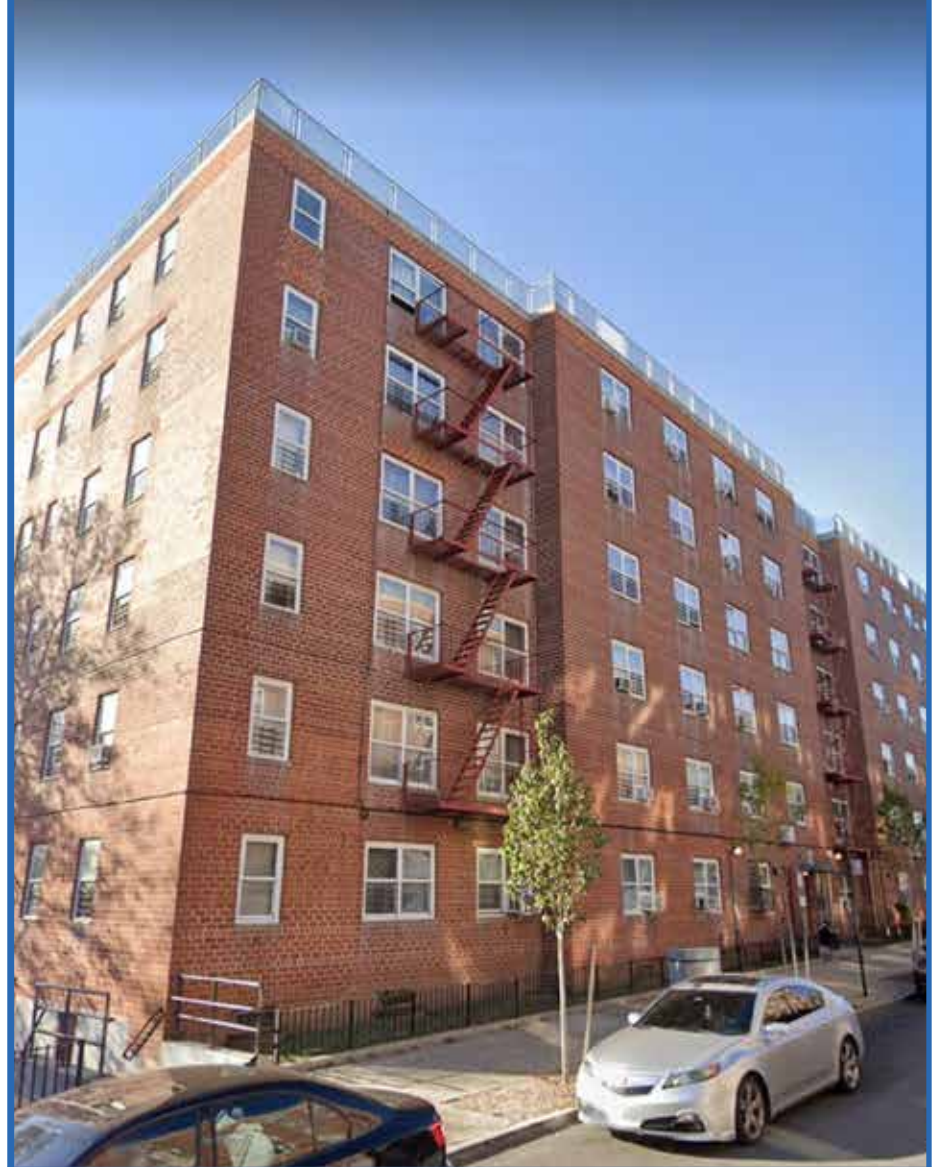
715 Noble Ave. - Sack Wern