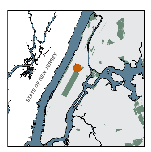
Prepared by: NYCHA Performance Tracking & Analytics Department