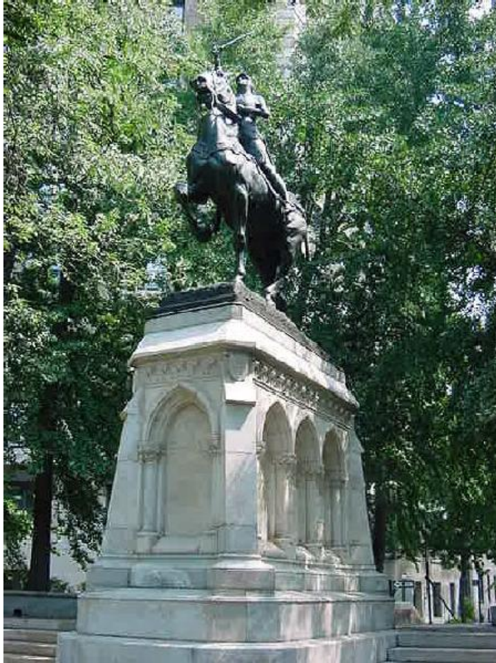
Joan of Arc Memorial

Riverside Drive at 93rd Street, Manhattan