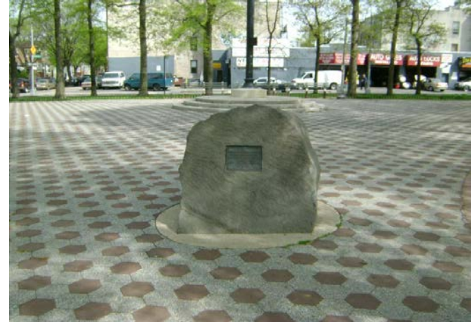
J. Wesley Drumm Marker

Drumm Triangle Cypress Hills St. and Cooper Ave, Queens