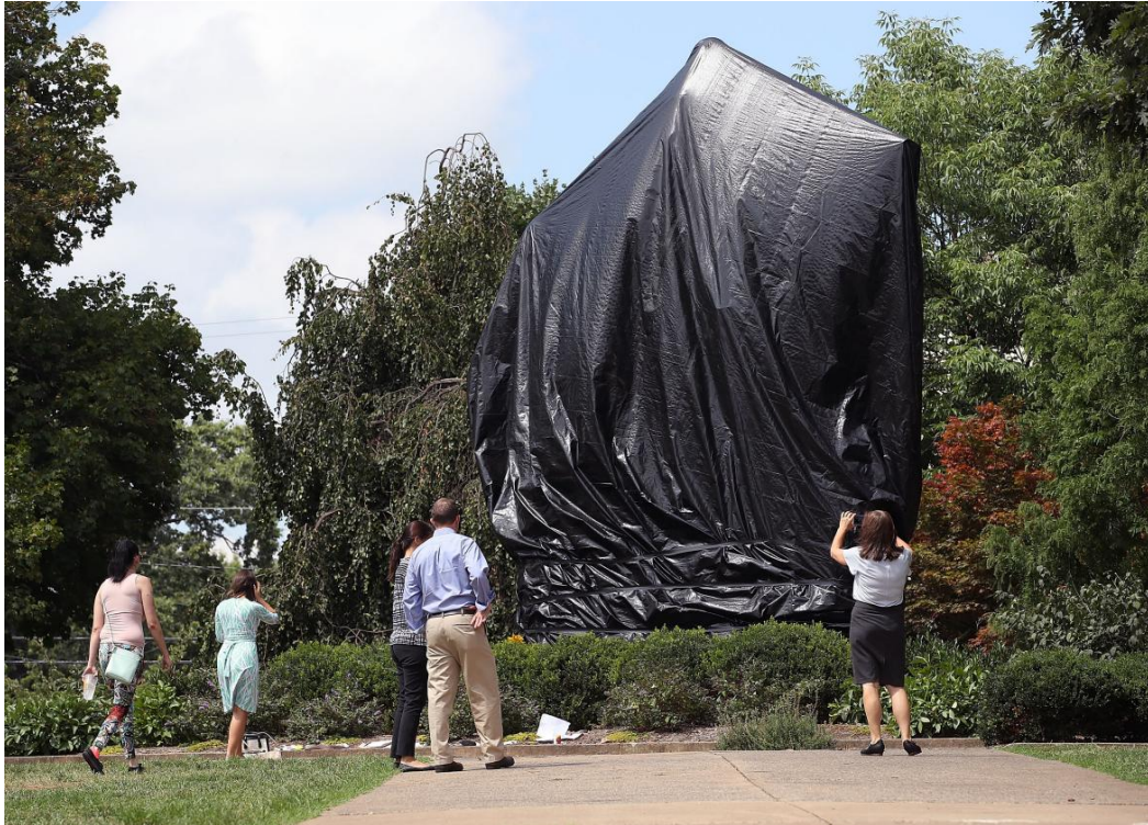
The statue of Confederate Gen. Robert E. Lee, covered with a black tarp, Emancipation Park, Charlottesville, VA.

Today, monuments are receiving greater attention nationally as people and municipalities across the country grapple with the representation of history and our current collective values.