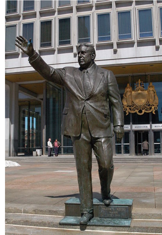
The statue of Mayor Frank L. Rizzo set for relocation, Municipal Services Building Plaza, Philadelphia, PA.