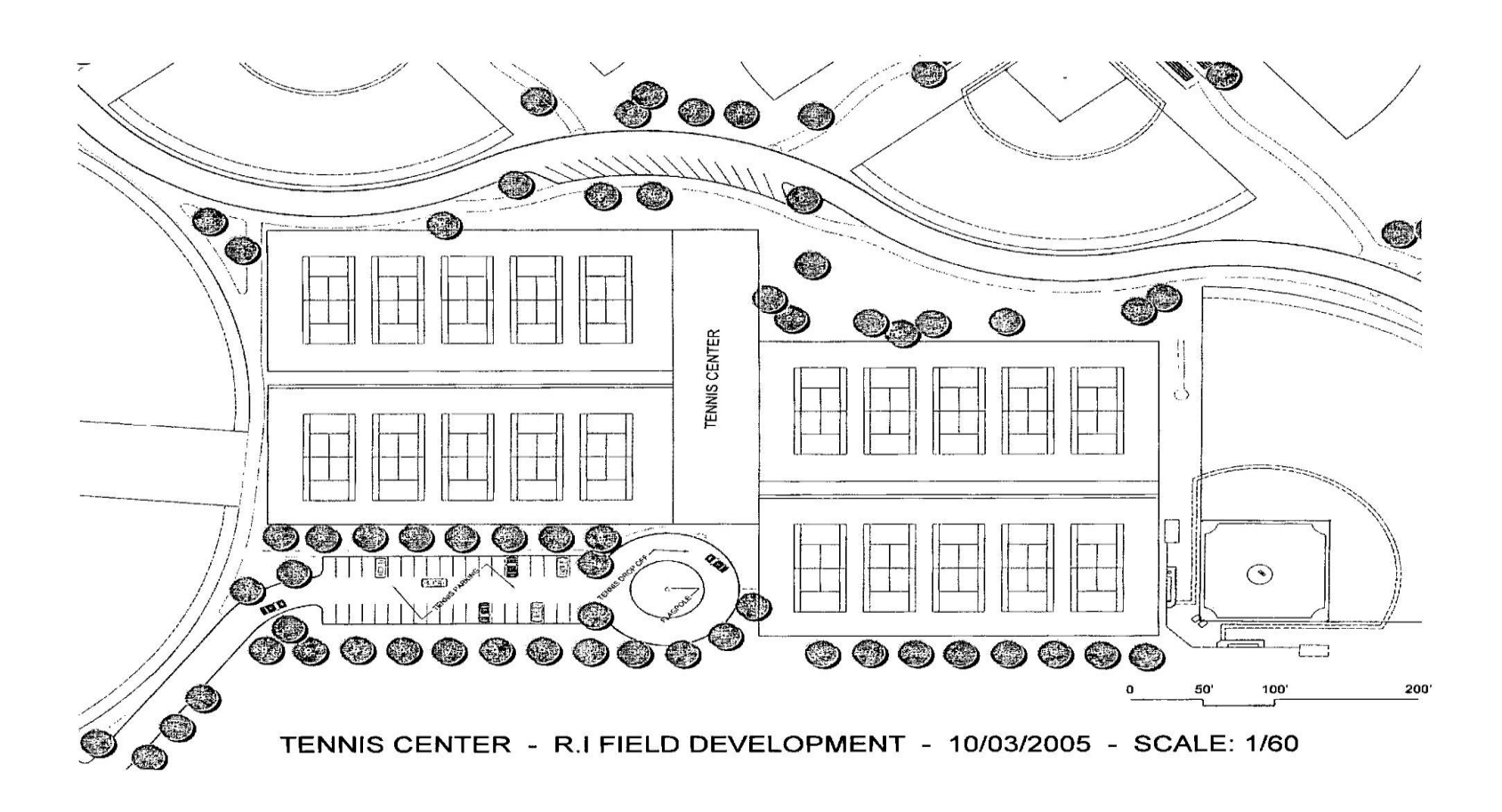
Exhibit A1 The Existing Licensed Premises