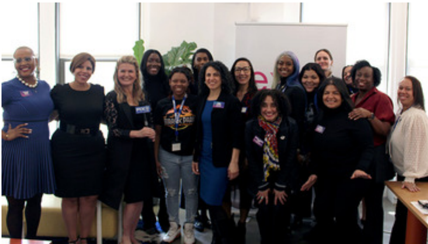
Event panelists together with attendees from The Future of Procurement .

On March 18th, female executive leaders from across the city gathered for a special celebration of Women's History Month and National Procurement Month at the exalt headquarters in Battery Park.