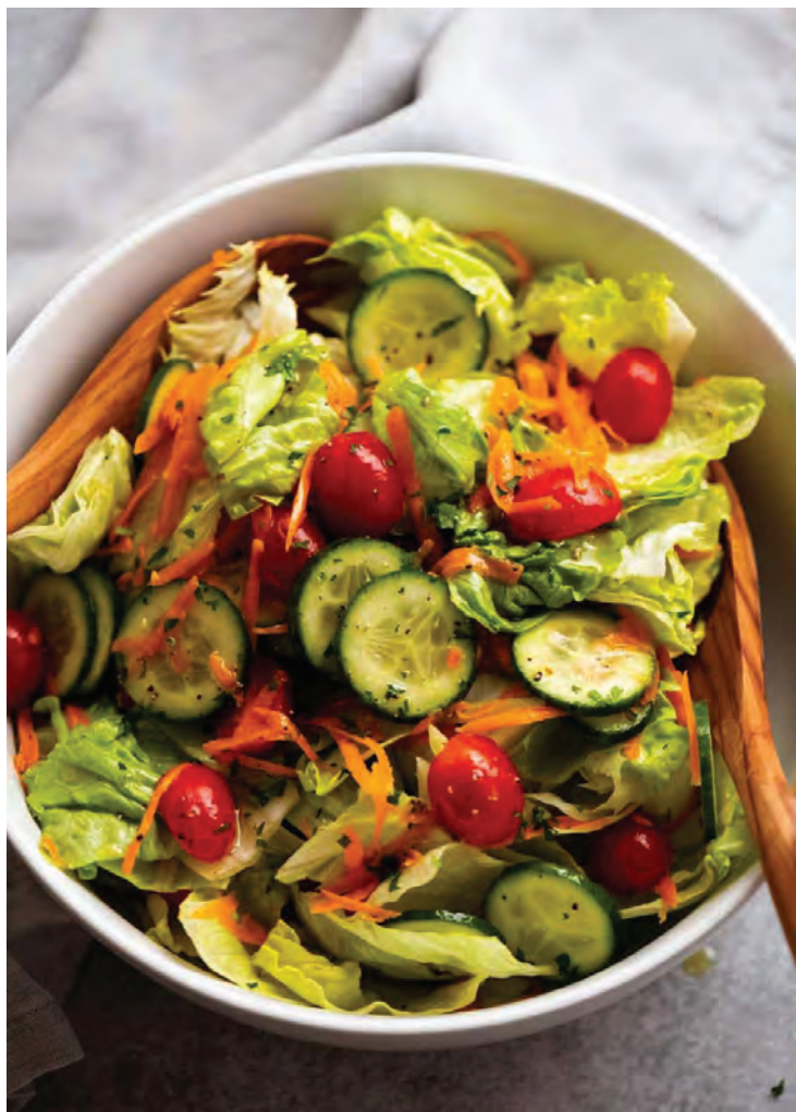
Garden Salad - $18