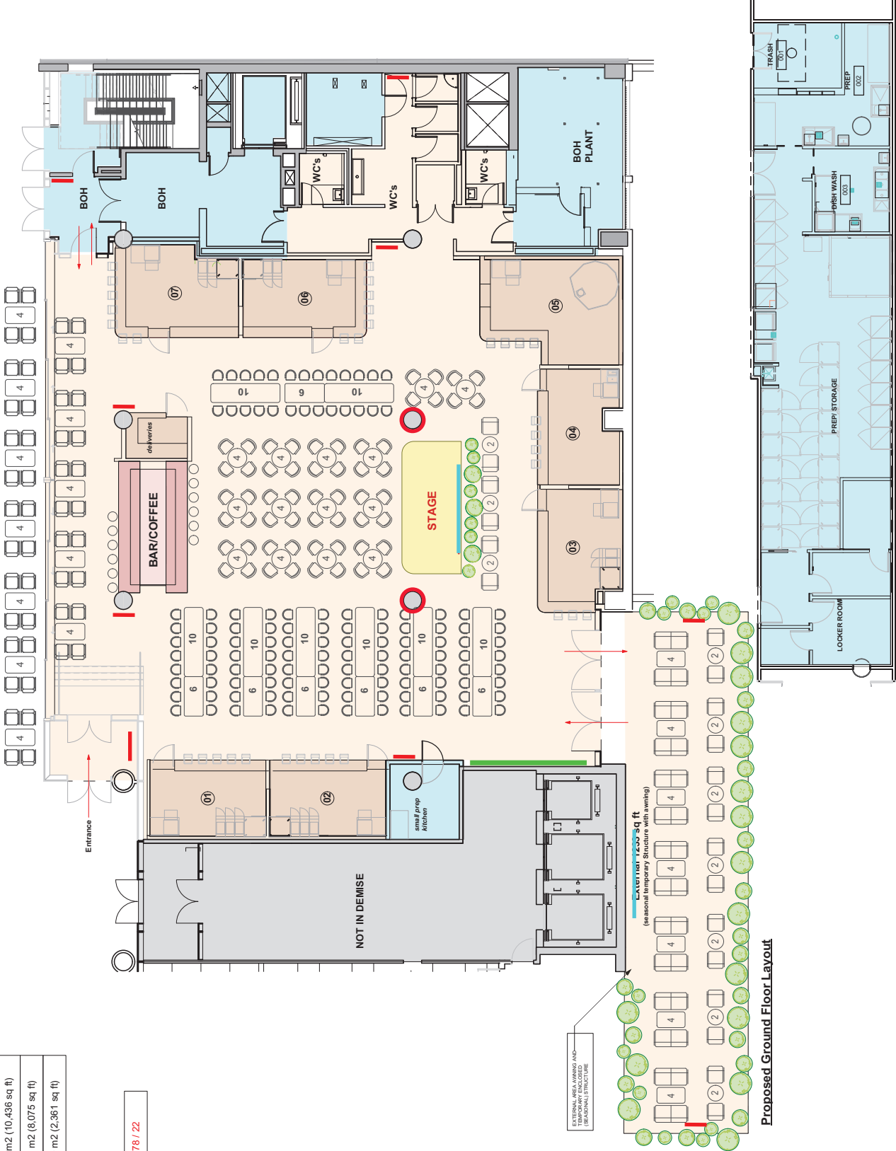
Proposed Ground Floor Layout