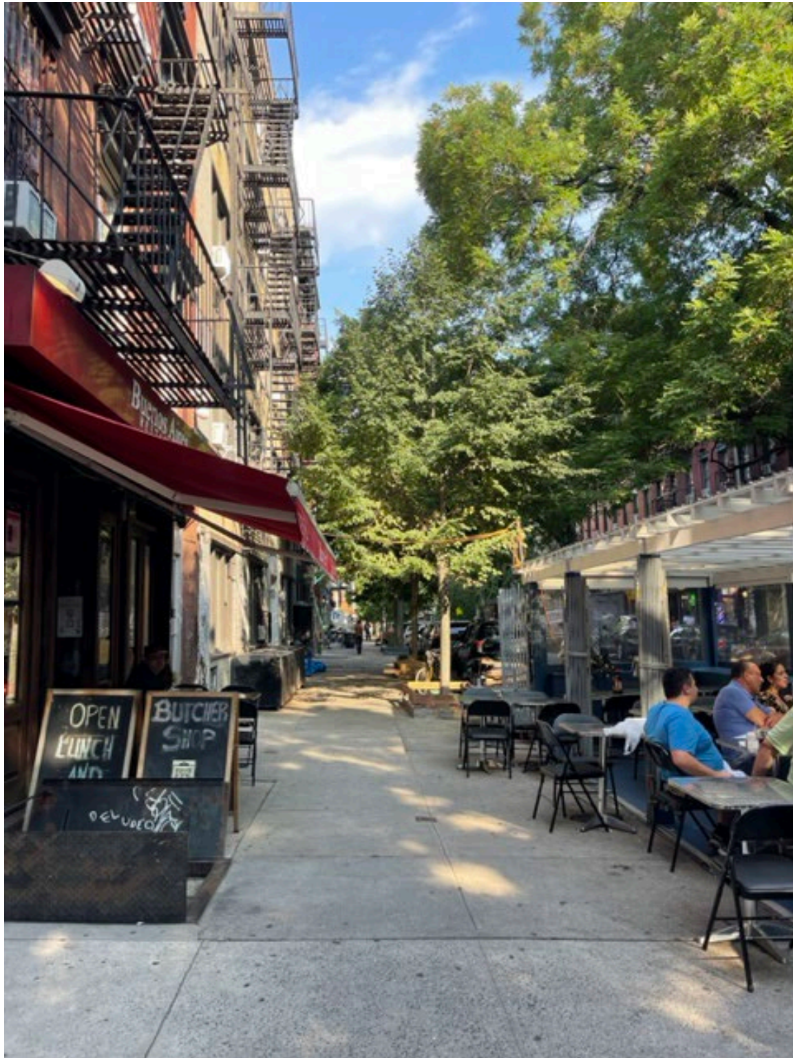
Site Photos- BUENOS AIRES (20240714010001)