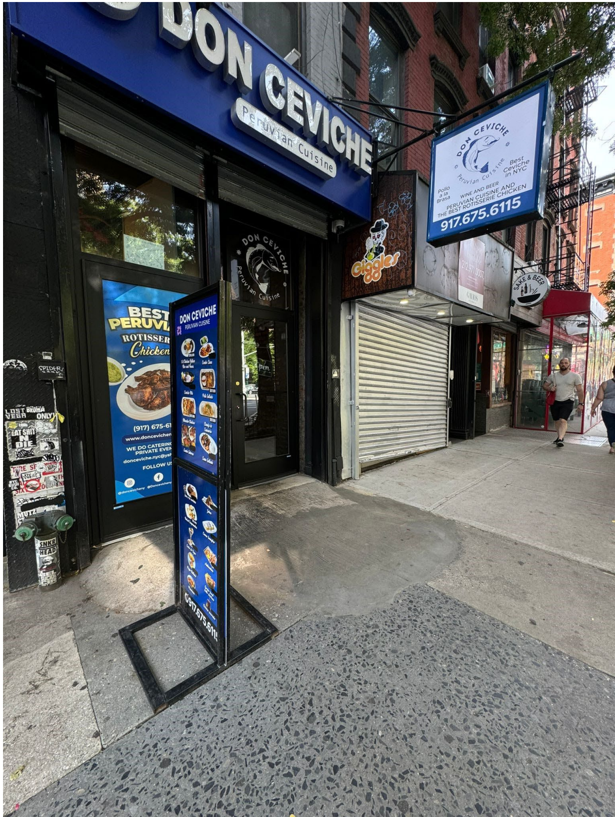
Site Photos- DON CEVICHE (20240702010005)