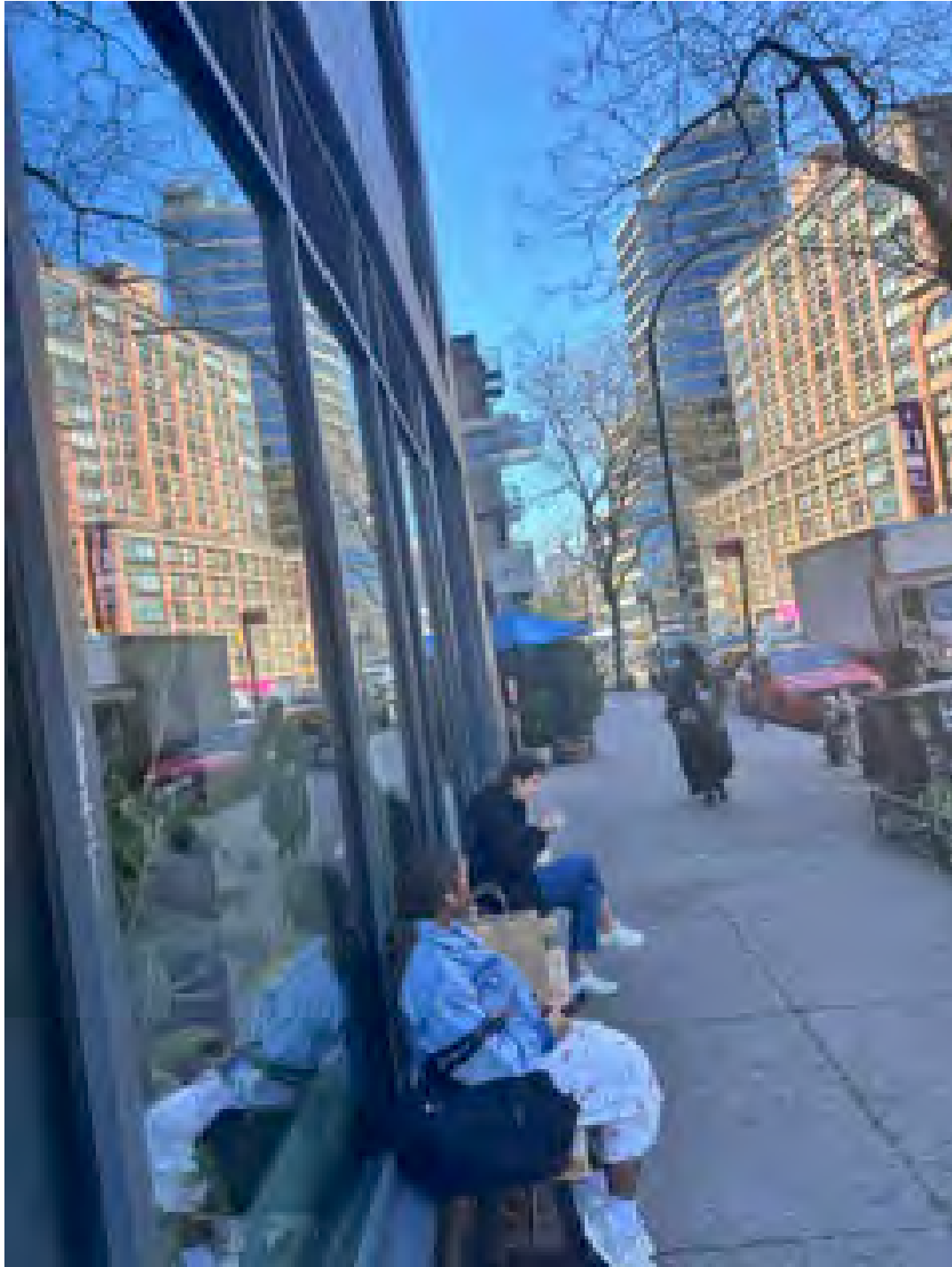
Site Photos- LIBRAE BAKERY (20240416010002)