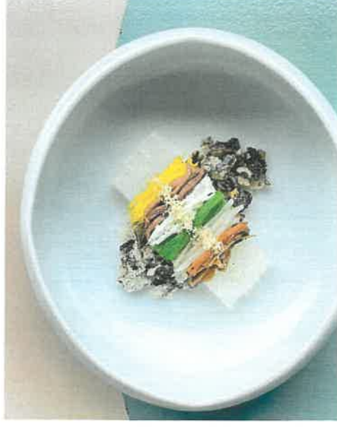
Mung Bean jelly with five kind of namul