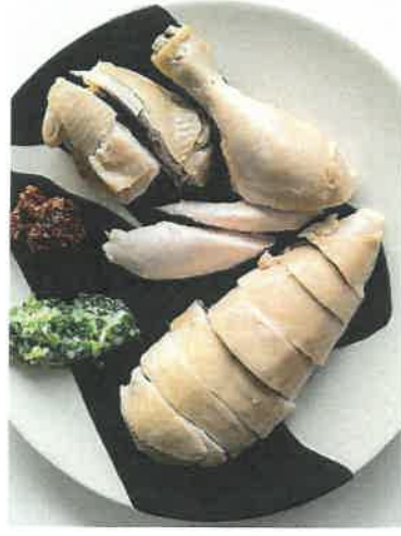
Steamed Korean chicken