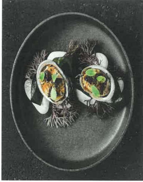
Cold smoked mussel with Seaweed