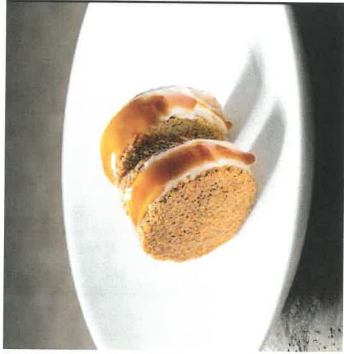
Yakwa ice cream sand