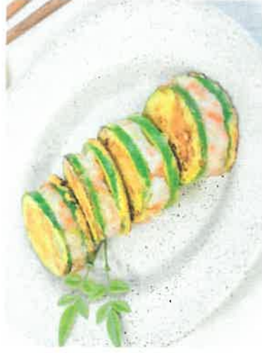
Squash shrimp jeon