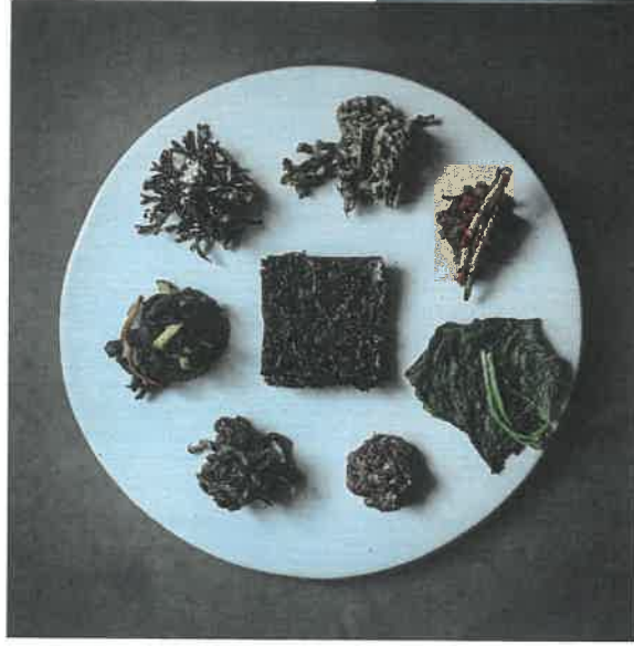
Fourth Course(Beakban / Rice and Soup with Banchan)