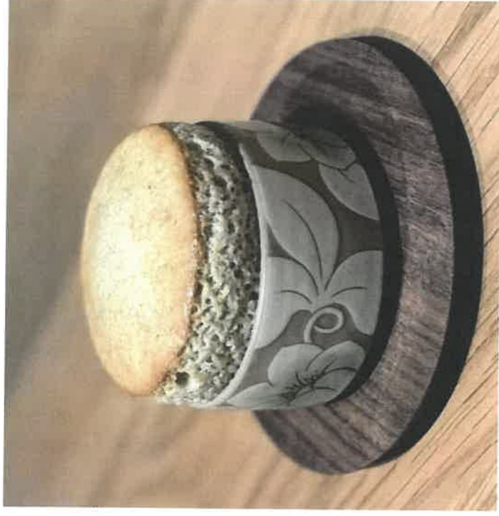
Black sesame soufflé with jam