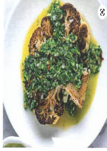
Fermented Cauliflower Gui