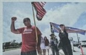
RAMBLAGE Trump supporters in Palm Beach, Fla., on Friday.