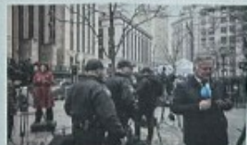
COUNTERPROTEST Media crews outside of a building in Manhattan.