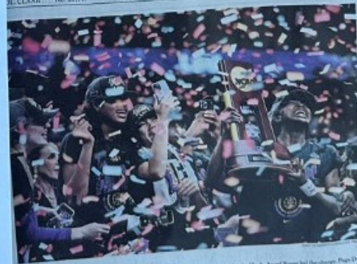
Bliss on the Bayou

Louisiana State won its first national title in women's basketball, beating Iowa and Caitlin Clark. Angel Reese led the charge. Page D4.