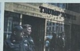
TRUMP TOWER N.Y.P.D. officers stood guard in case of protests.