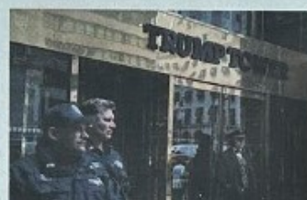
TRUMP TOWER N.Y.D. officers stood guard in case of protests.