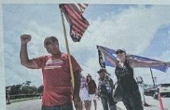
TRUMP TOWER N.Y.D. officers stood guard in case of protests.