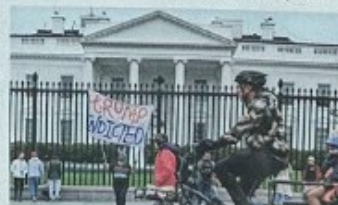
WHITE HOUSE A protester in Washington, where it remained calm.