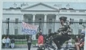
WHITE HOUSE A protester in Washington, where it was held earlier.