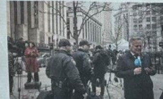
COURTHOUSE Media crews outside the building in Manhattan.