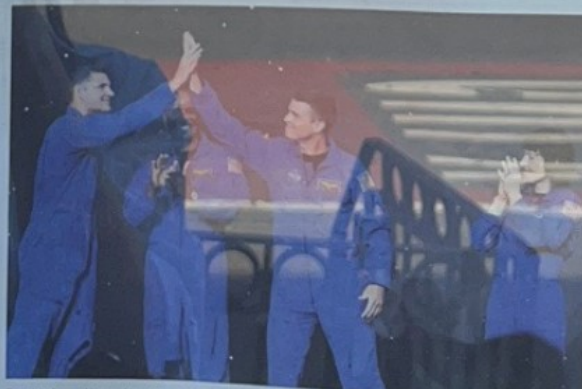
From left, Jeremy Hansen, Victor Glover, Reid Wiseman and Christina Koch were announced as the crew for a new moon mission.