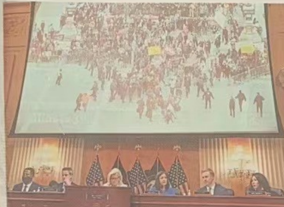
The Jan. 6 panel on Thursday focused on the 187 minutes that Donald J. Trump "chose not to act" as voters swarmed the Capitol.