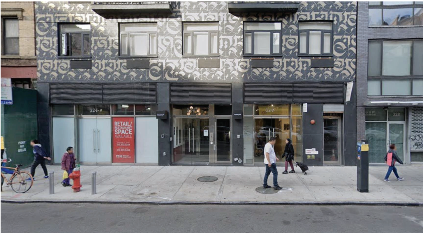
324 Grand St - Outside Photo