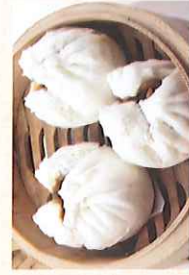
叉燒包 $5.25 BBQ Pork Buns (3)