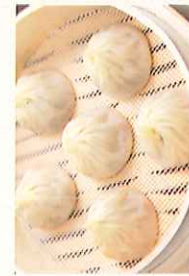
上海小籠包 $7.25 Shanghai Juicy Pork Bun (6)