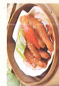
鳳爪 $4.25 Chicken Feet