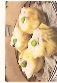
雞燒賣 $4.25 Chicken Shu Mai (4)