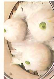
羅漢齋餃 $5.25 Buddha Delight Dumpling (3)