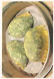
韭菜鮮蝦餃 $5.25 Steamed Shrimp & Chives Dumplings (3)