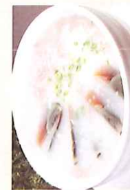
皮蛋瘦肉粥 $5.95 Pork & Thousand Year Egg Congee