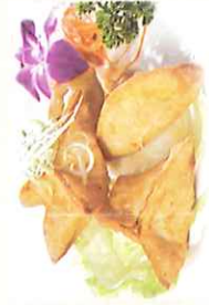
菠蘿芝士蟹舌 $5.25 Pineapple Cheese Wonton (4)