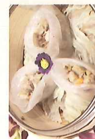
竹筍餃 $5.25 Bamboo Shoot Dumpling (3)