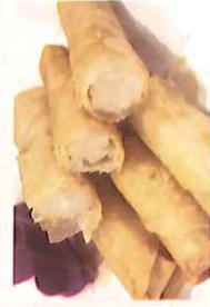
香脆蝦卷 $5.25 Shrimp Roll (3)