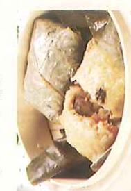
珍珠雞 $5.25 Sticky Rice w/ Pork Wrapped in Lotus Leaf (2)