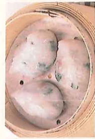
湖州粉果 $5.25 Chou Zhou Dumplings w. Pork & Peanut (3)