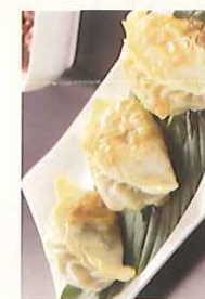
煎香鮮蝦餃 $5.95 Pan Fried Pork & Chives Dumplings (3)