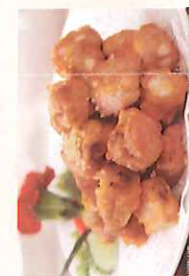
蒜香排骨 $7.25 Crispy Garlic Spare Ribs