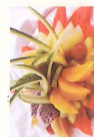
水果盤 $8.25 Fresh Fruit Platter