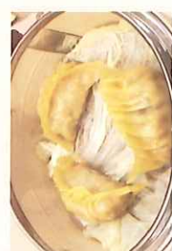
雞肉餃 $4.25 Chicken Dumpling