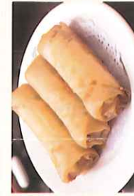
鴨絲春卷 $6.25 Shredded Roast Duck Spring Roll (3)