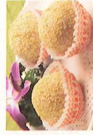
麻蓉蓮蓉球 $4.25 Sweet Sesame Ball (3)