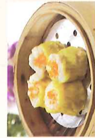
燒賣皇 $4.25 Shu Mai (Shrimp & Pork) (4)