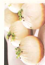
生煎包 $5.95 Pan Fried Tiny Bun (3) (Pork, Shrimp & Veg)