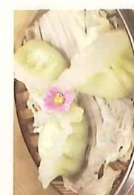
毛豆餃 $5.25 Soy Bean Dumpling (3)