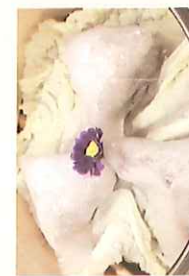
三菇餃 $5.25 Mixed Mushroom Dumpling (3)