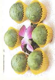
綠茶圓 $4.25 Crispy Green Tea Rice Ball (3)