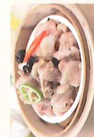
豉汁蒸排骨 $4.25 Steamed Spare Ribs w/ Olive Sauce