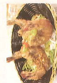
椒鹽蝦碌 $10.25 Salt & Pepper Jumbo Shrimp (w/Steal)