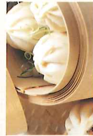
鮮蝦菜肉包 $5.25 Pork & Shrimp w. Veg Bun (3)