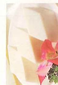
椰汁糕 $5.25 Coconut Cake (3)