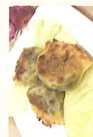
煎鮮蝦菜餃 $5.95 Pan Fried Shrimp & Chives Dumplings (3)