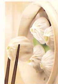
蟹肉小籠包 $9.25 Crabmeat Juicy Pork Bun (6)