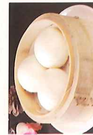
奶皇流沙包 $5.25 Sweet Egg Yolk Creamy Bun (3)