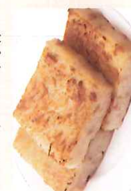
煎蘿蔔糕 $5.95 Pan Fried Turnip Cake