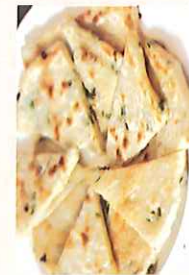
蔥油餅 $5.95 Scallion Pancakes