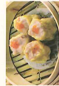
海鮮燒賣 $5.25 Seafood Shu Mai (4)