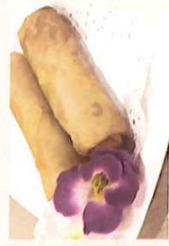
素菜春卷 $3.95 Vegetable Spring Roll (2)