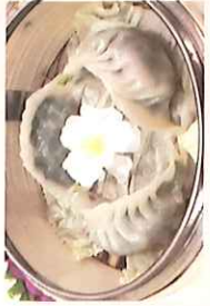
京蔥餃 $4.25 Pork and Chive Dumpling (3)