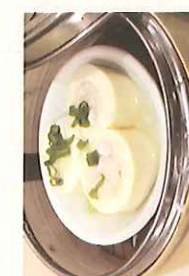
客家釀豆腐 $5.25 Shrimp Stuffed Tofu (3)