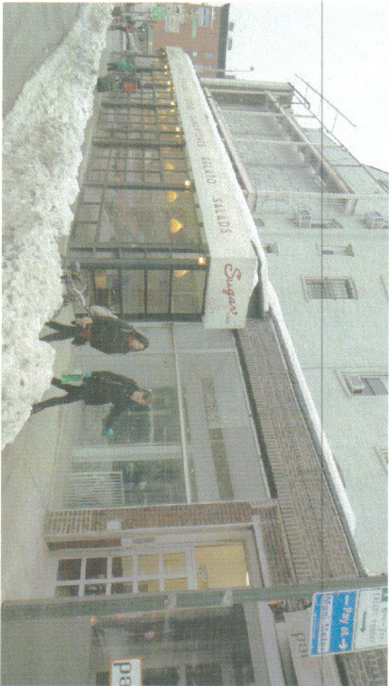
② EXTERIOR VIEW - AT ALLEN STREET