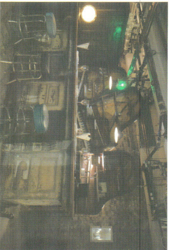
① INTERIOR VIEW - AT CELLAR BAR