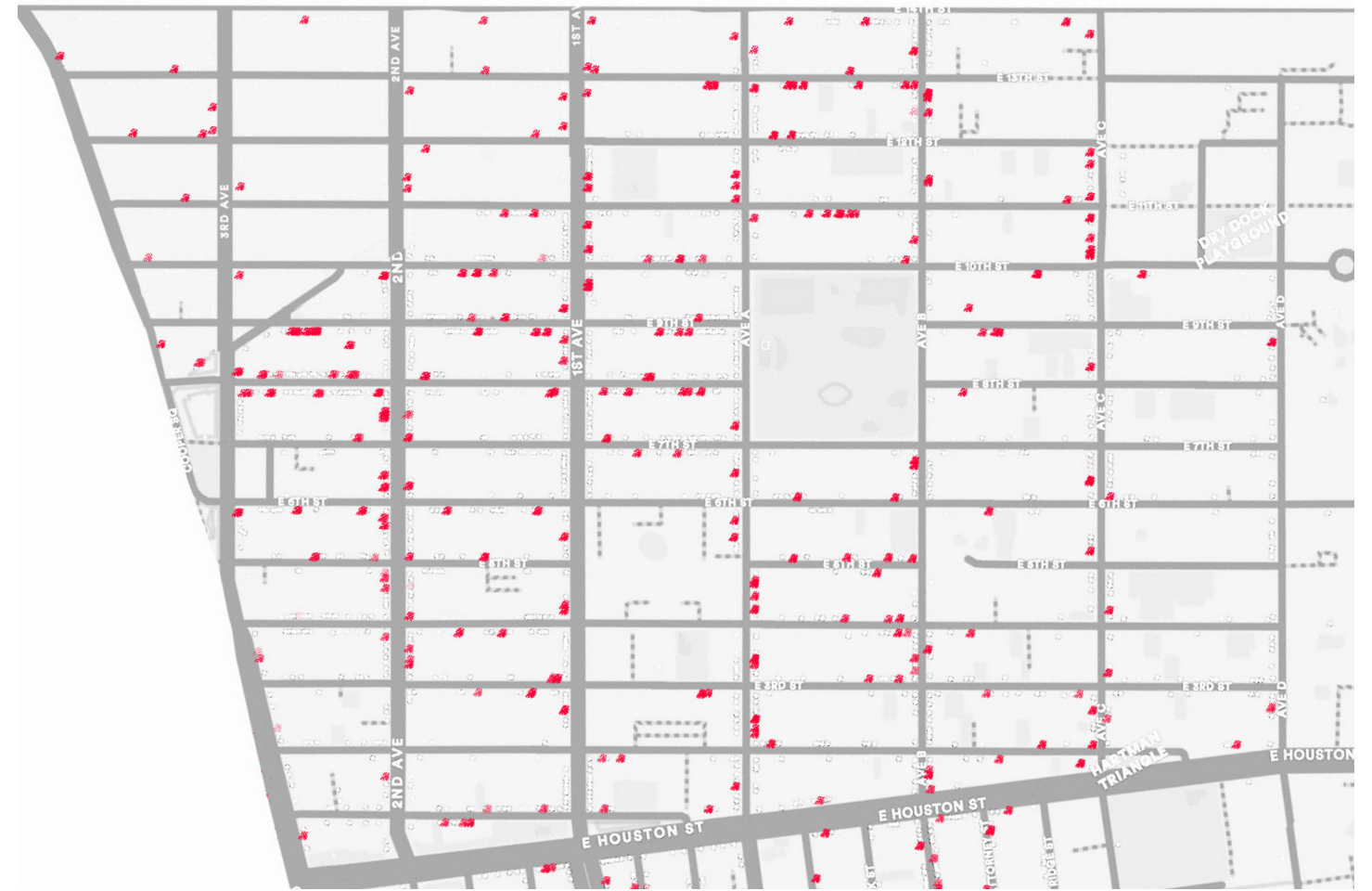
LIVE XYZ 2025 VACANT STOREFRONTS