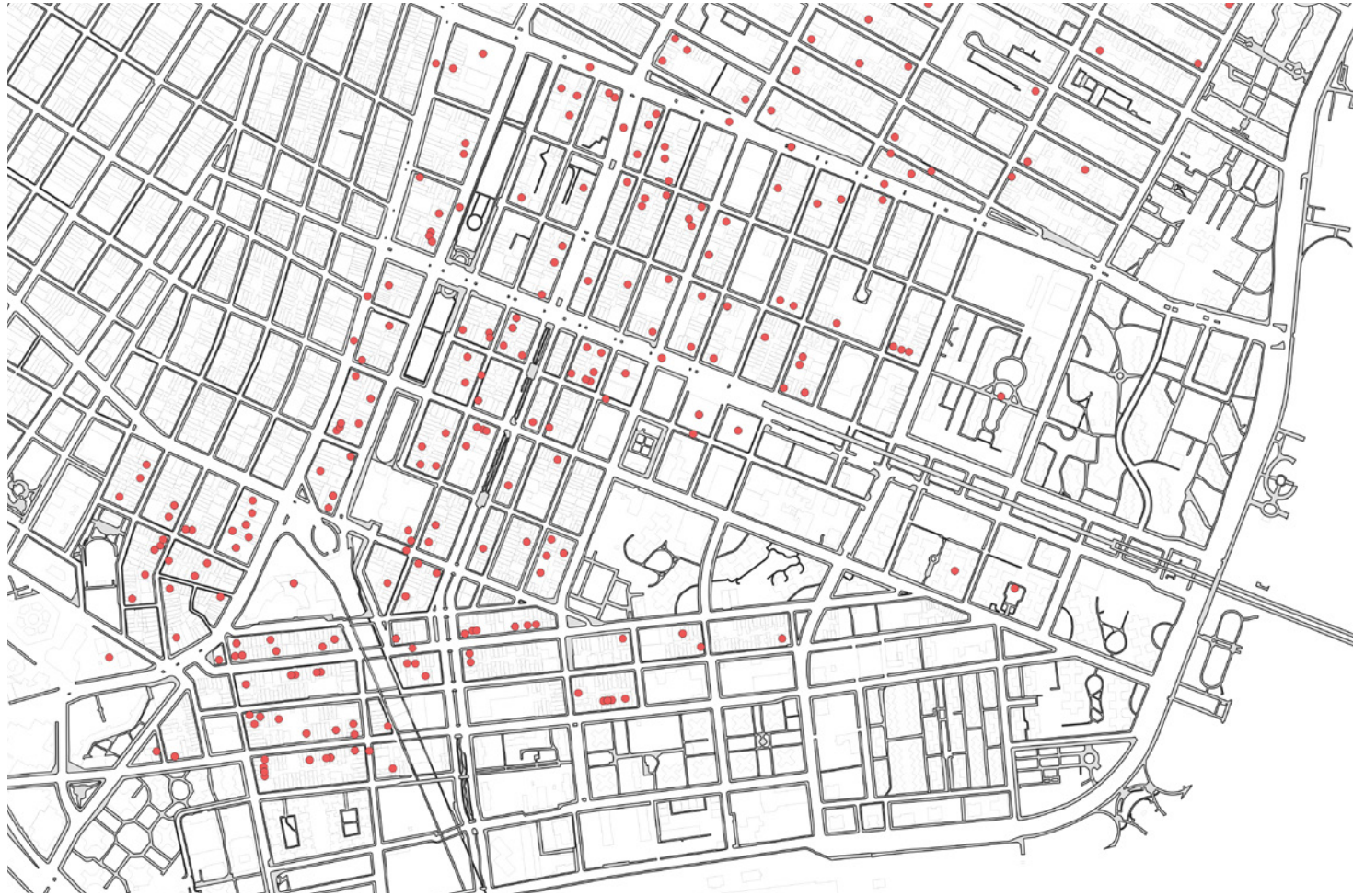
NYC OPEN DATA 2023-2024 VACANT STOREFRONTS