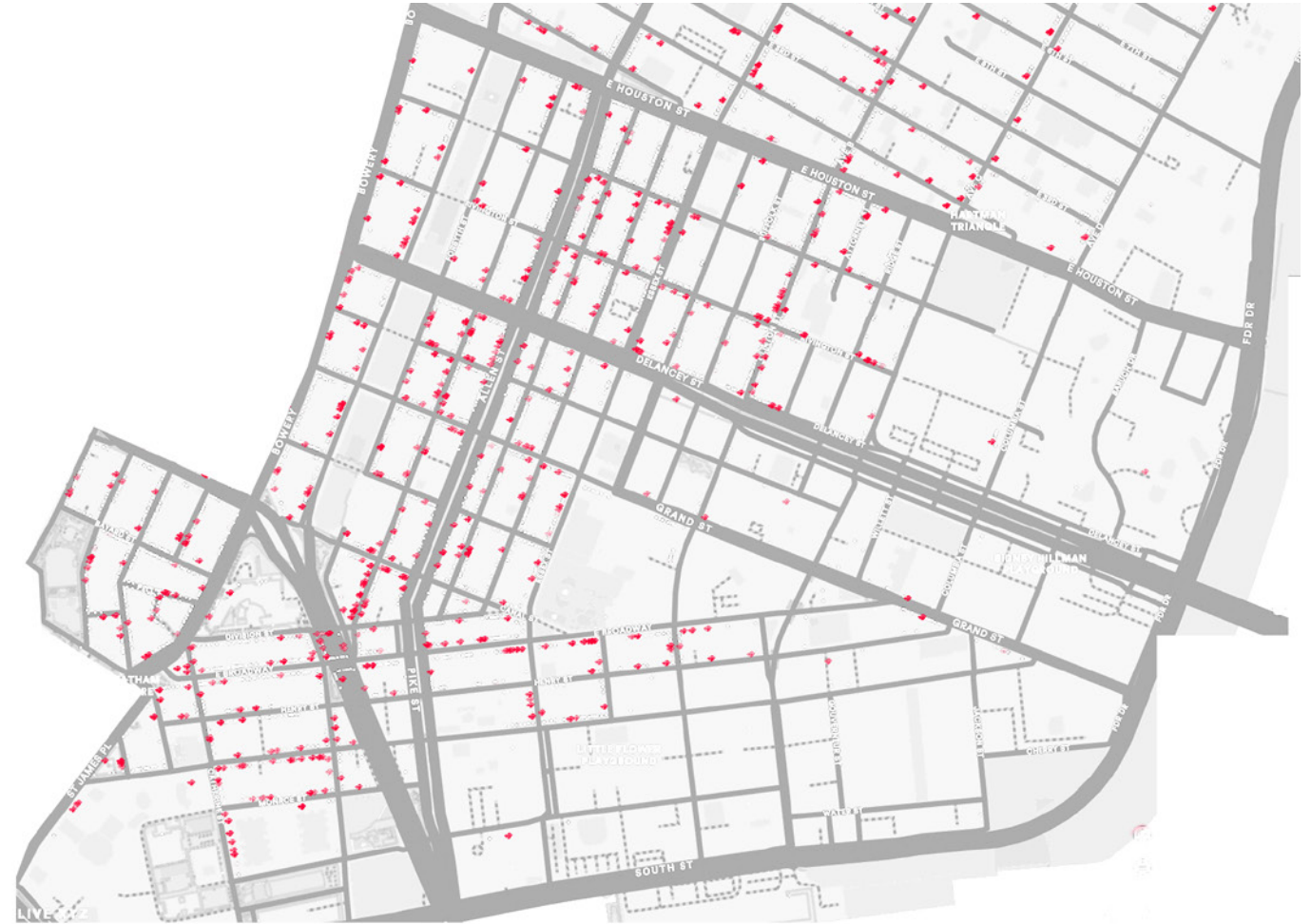
LIVE XYZ 2025 VACANT STOREFRONTS