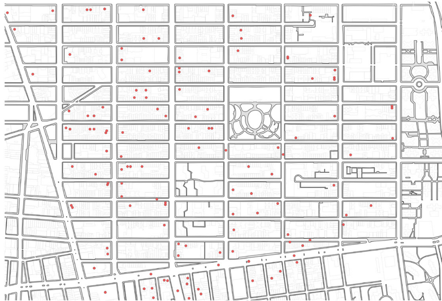
NYC OPEN DATA 2023-2024 VACANT STOREFRONTS