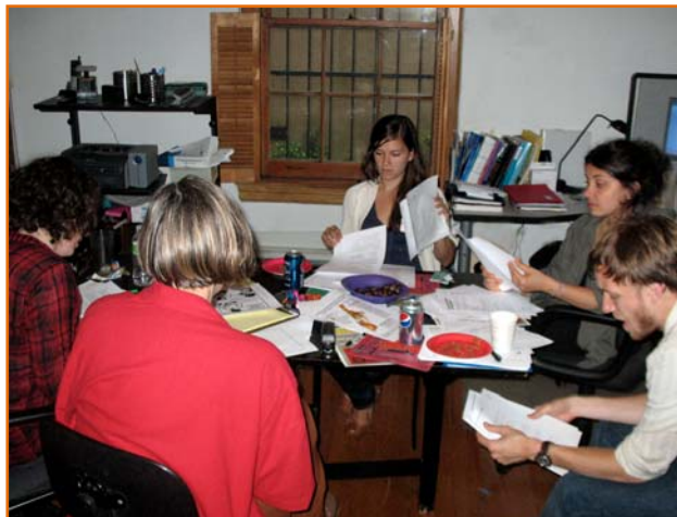
Lesson Plan Focus Group at AFSZ Office

Focus group participants were asked to attend two sessions with AFSZ. During the first meeting, participants reviewed and offered feedback on a first draft of the lessons. Following the first meeting, AFSZ staff edited and reformatted lesson plans using the feedback from focus group participants, then distributed a second draft in preparation for further review and in some cases trial teaching by participants.