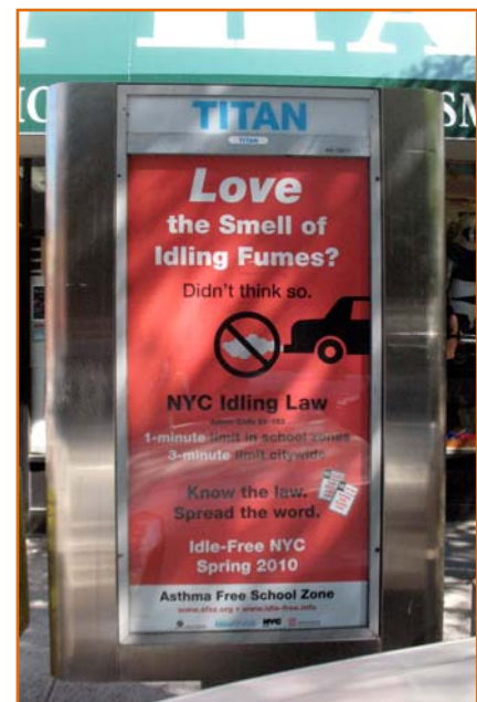
Idle Free NYC 2010 Poster at 5 th Street and Avenue A

Telephone Kiosk Posters: AFSZ conducted Year 3 of the Idle Free NYC campaign with specific focus on CB3. This year we assessed multiple outdoor advertising firms to see which could provide us with solid coverage of CB3. Where Titan Outdoor managed bus tail advertising last year during our citywide campaign, this year the contract has gone to CBS Outdoor. We found that it is impossible for CBS to control which routes buses with specific advertising will follow on any particular day. Consequently we considered