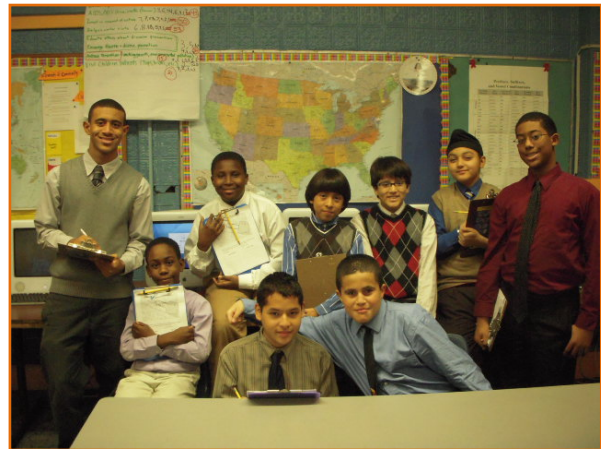
AFSZ Service Learning Students at George Jackson Academy

Middle-High School Sites: In conjunction with a middle school teacher at George Jackson Academy, AFSZ staff conducted a service learning project with an advisory group of nine middle school students. AFSZ staff designed materials and a lesson plan in cooperation with the teacher, who led her own lessons as an introduction to the service learning project. As part of the lesson, students received a basic overview of asthma, led by AFSZ staff. AFSZ staff then led small groups of students on a neighborhood walk-around and helped students to assess what environmental risks and strengths were present in the neighborhood surrounding the school. Students also conducted interviews with local business owners about their environmental concerns. Following the activity, students discussed ways to encourage community participation on environmental issues, then created presentations for the student body about their work.