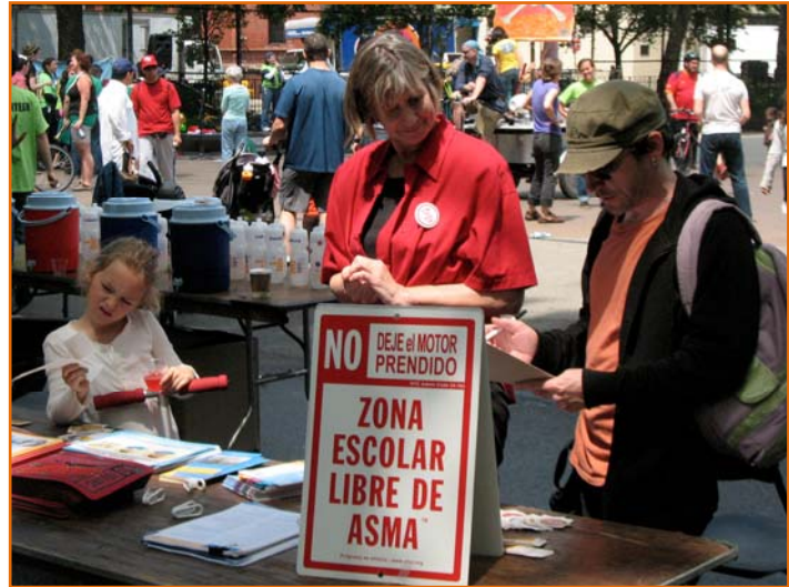
AFSZ table at LES Bike Parade - May 15, 2010

AFSZ also participated in the East Village Bike Parade on May 8, 2010. We had a table and handed out literature and spoke with numerous passersby about the AFSZ and Idle-Free NYC programs and about the importance of observing and enforcing the idling restriction laws that we helped the City Council to pass. We also spoke about school zone health and safety to many parents from local schools.