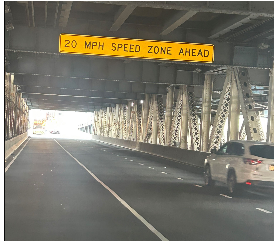
Above: Improved Speed Advisory signage recently installed