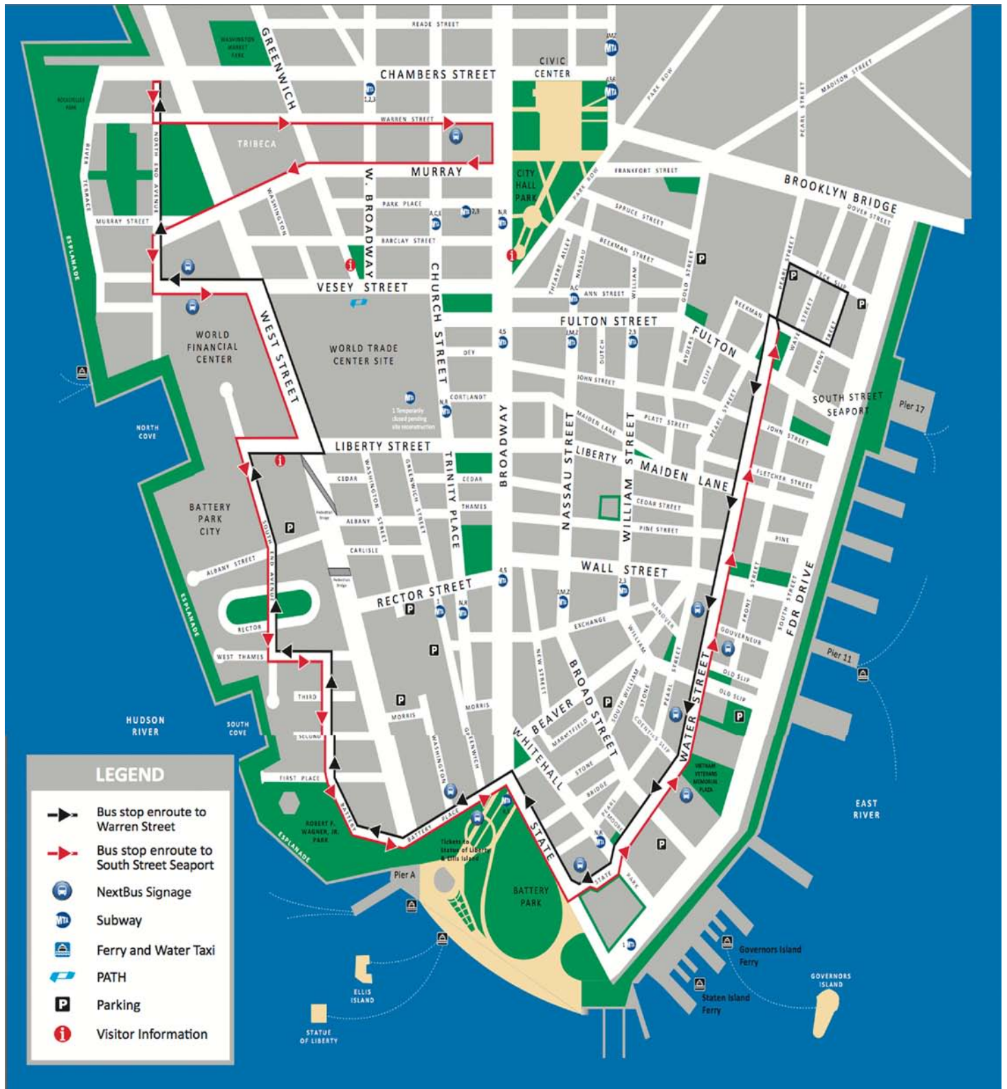
Map A: Downtown Alliance Connection Bus Route