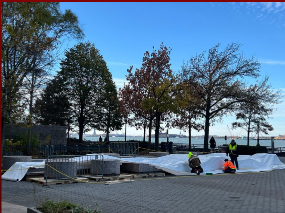
BPCA Art- It's a Wrap