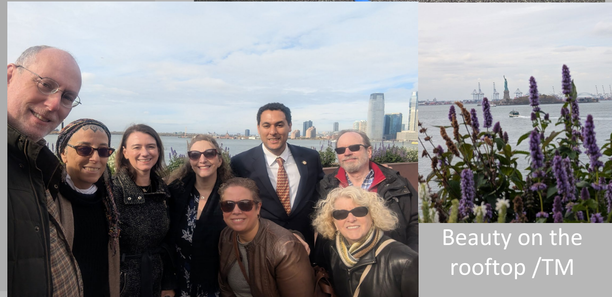
Beauty on the rooftop /TM