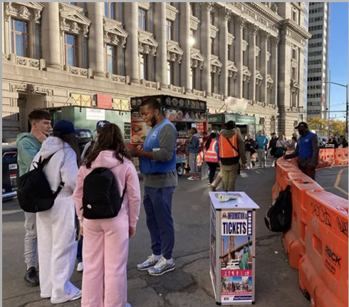
LEFT:Photo Courtesy of The Broadsheet BELOW: signage left over & West Thames Meeting