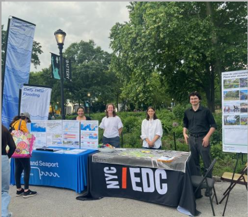
EDC Tabling at The Battery

Photos Courtesy of Wendy Chapman Many Thanks!