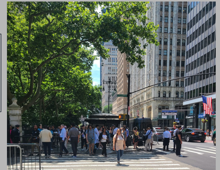
Downtown Beauty & Protests