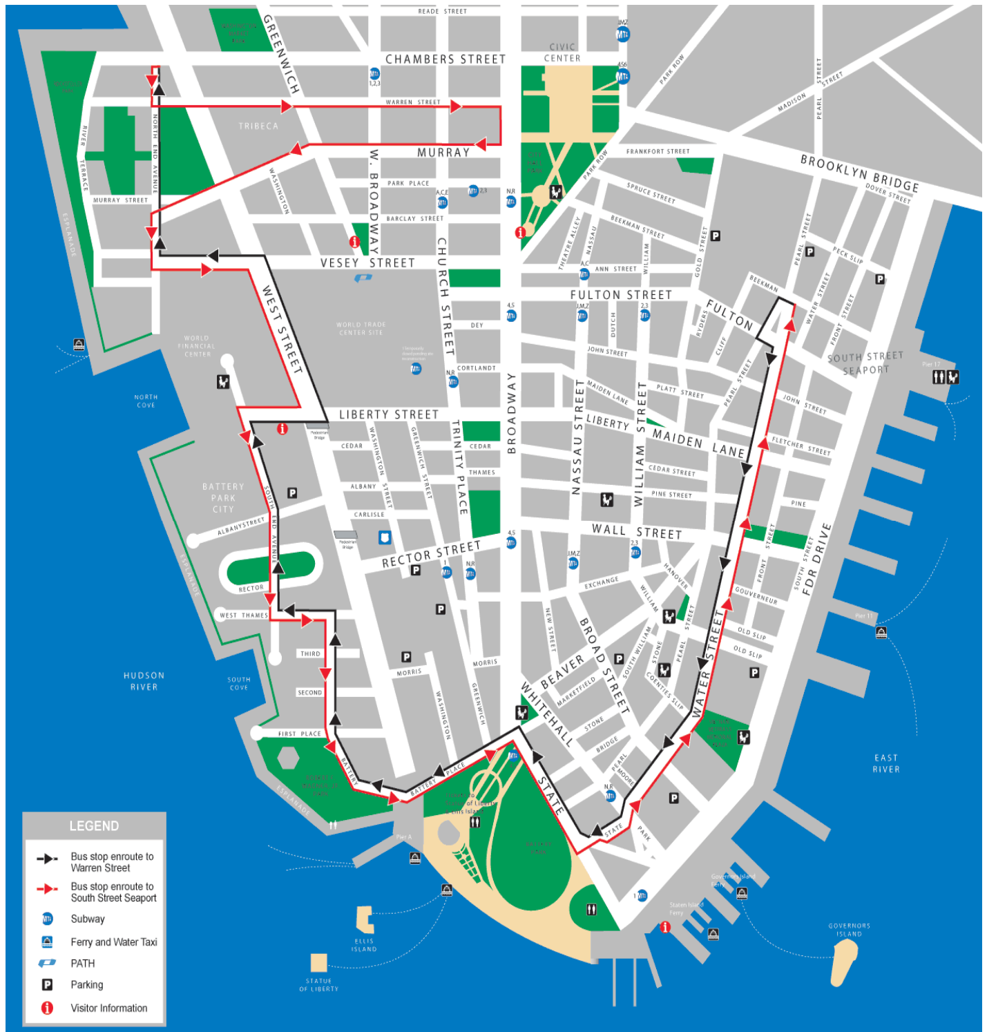
Figure 1. Downtown Alliance Connection Bus Route.