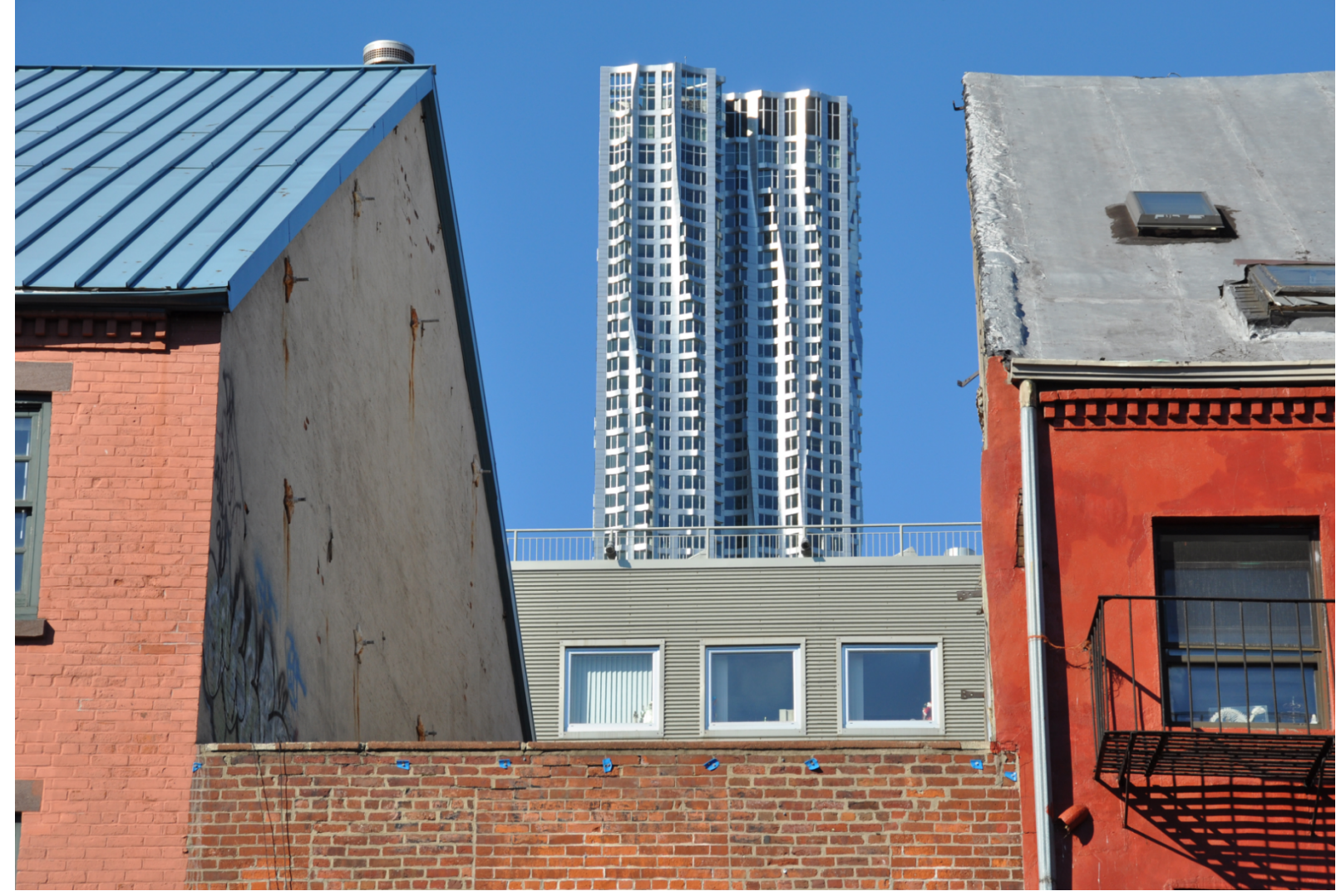
Robert Simko © 2011

Report by the Manhattan Community Board 1 Affordable Housing Task Force Updated June 2012 (First publication July 2011)