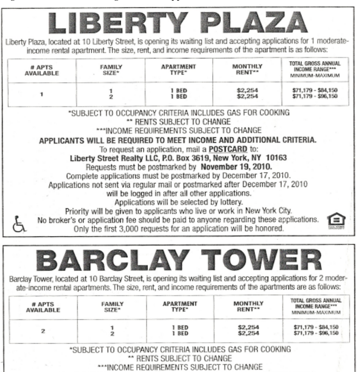
Figure 1. Affordable housing notice as it appeared in the Tribeca Trib

*SUBJECT TO OCCUPANCY CRITERIA INCLUDES GAS FOR COOKING * RENTS SUBJECT TO CHANGE ***INCOME REQUIREMENTS SUBJECT TO CHANGE APPLICANTS WILL BE REQUIRED TO MEET INCOME AND ADDITIONAL CRITERIA. To request an application, mail a <u>POSTCARD</u> to: Barclay Street Realty LLC, P.O. Box 3619, New York, NY 10163 Requests must be postmarked by November 19, 2010. Complete applications must be postmarked by December 17 2010. Applications not sent via regular mail or postmarked after December 17, 2010 will be logged in after all other applications. Applications will be selected by lottery. Priority will be given to applicants who live or work in New York City. No broker's or application fee should be paid to anyone regarding these applications. Only the first 3,000 reguests for an application will be honored.