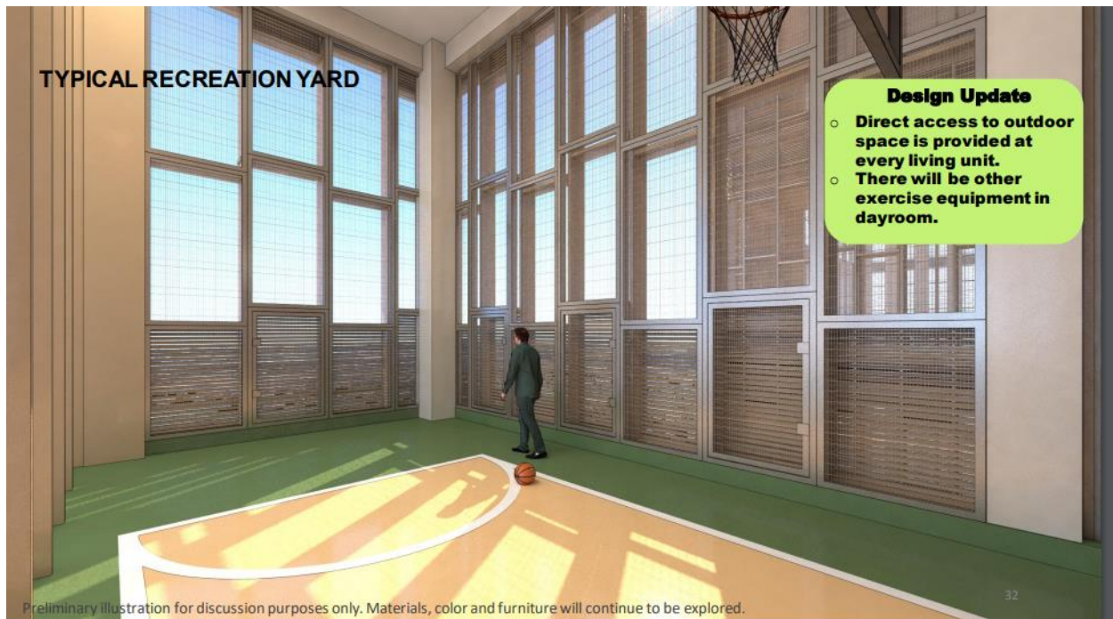
Image: Proposed Recreation Yard for the Brooklyn borough-based jail 7

The Board’s Minimum Standards set forth specific requirements for recreation. Section 1-06 of the Minimum Standards provides that the Department of Correction must afford people in custody with the opportunity to go to outdoor recreation seven days per week, for at least one hour every day, except in “inclement weather,” when the Department must make available the indoor recreation area, see § 1-06(c). The indoor and outdoor recreation spaces “must be of sufficient size to meet the requirements of this section,” and the outdoor recreation areas “must allow for direct access to sunlight and air” see §1-06(b). The BBJ team stated that the proposed recreation spaces described above “allow [] for direct access to sunlight and air through the security mesh surrounding the areas,” the Department believes that the current design of those spaces satisfy the Minimum Standards.