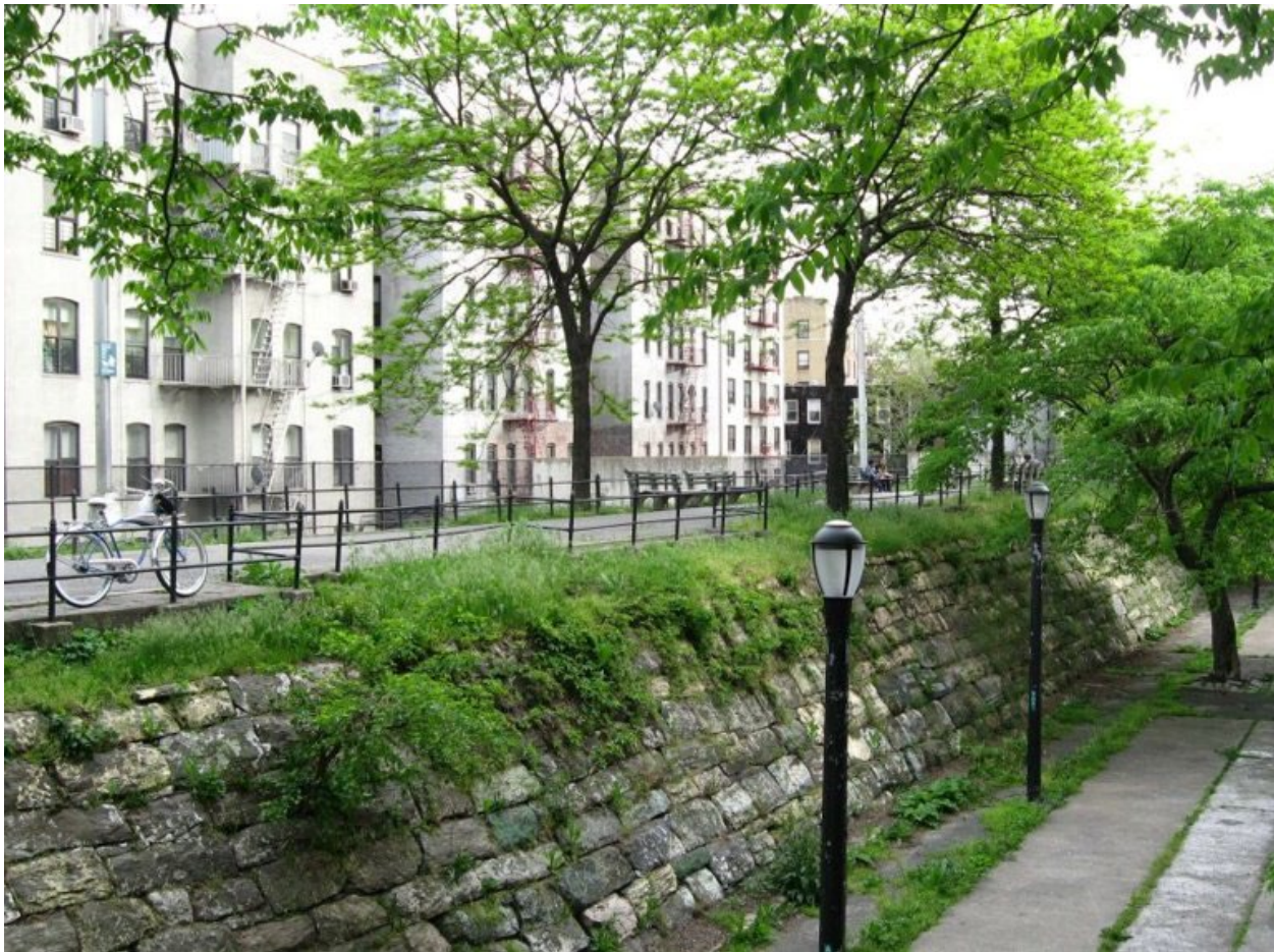
Old Croton Aqueduct Walk, LPC, 2023

Proposed Action: Calendared August 15, 2023, October 3, 2023; Public Hearing November 14, 2023, Proposed for Designation April 16, 2024