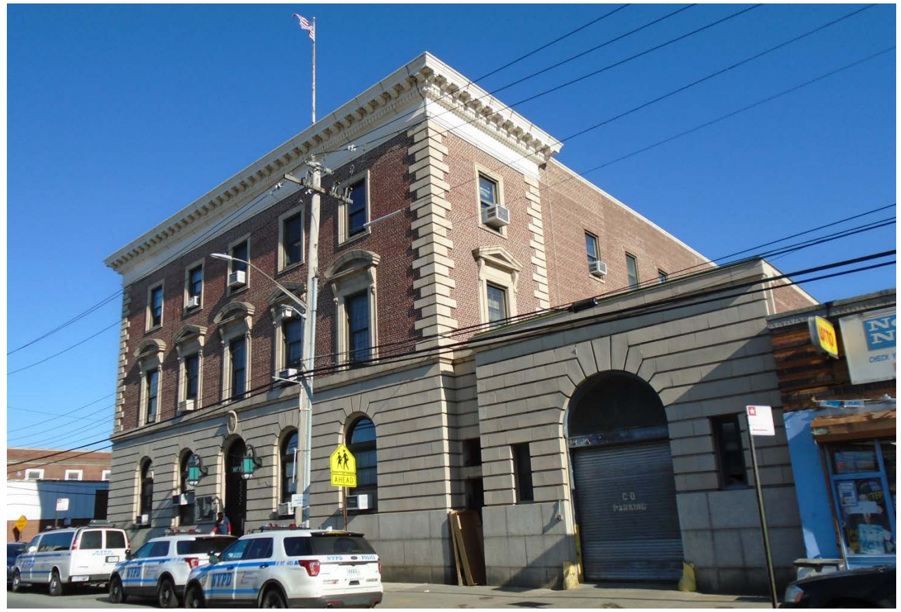
53rd (now 101st) Precinct Police Station and Garage, Mott Avenue Facade, LPC, 2018