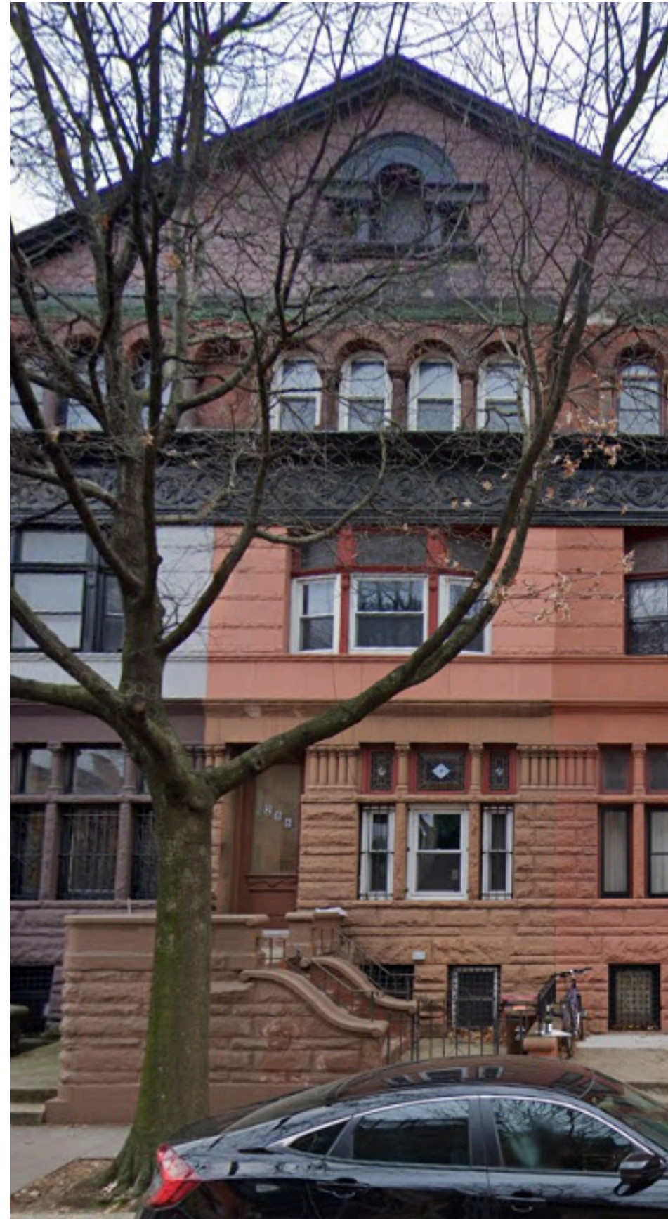
Prior to Work Photo, 2024.