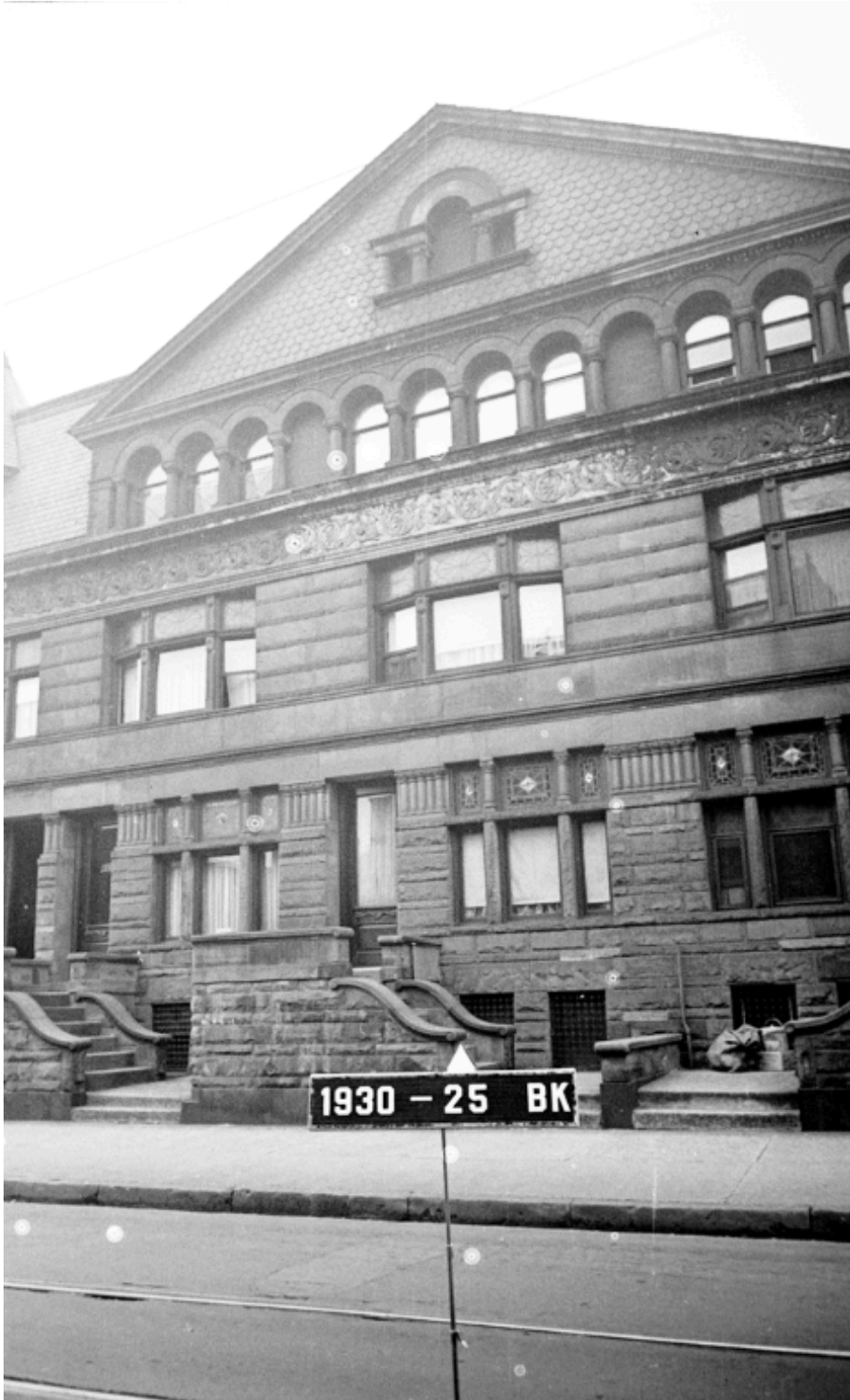
Historical 1940s photo.

The property is located between Waverly Ave and Clinton Ave.