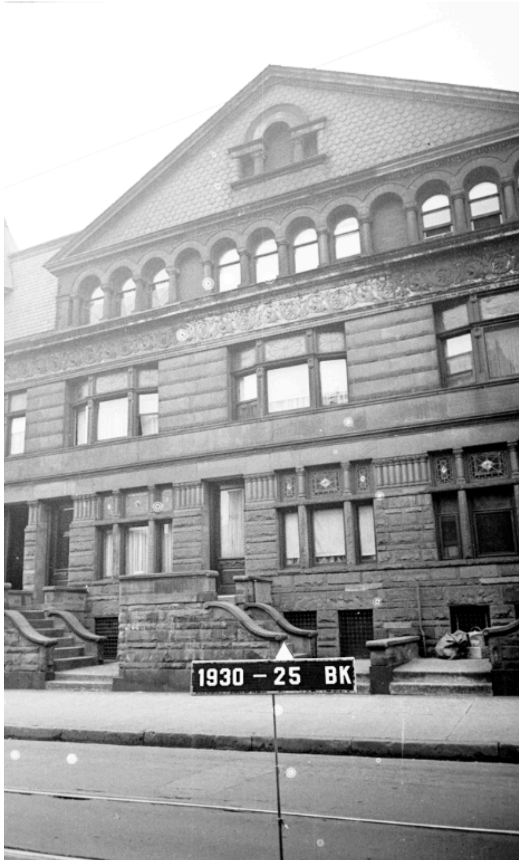
Historical 1940s photo.