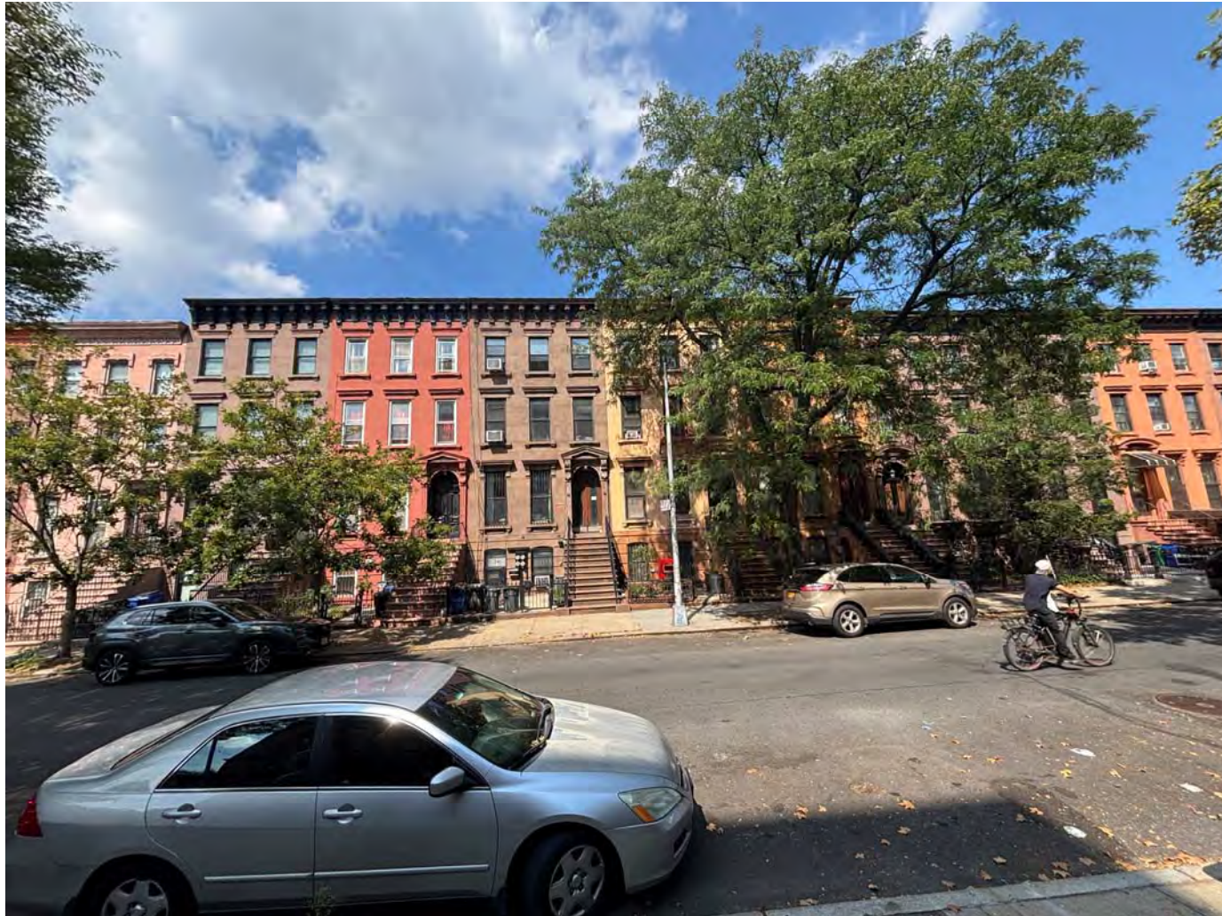
1 263 – 271 Madison Front Façades of Neighboring Buildings