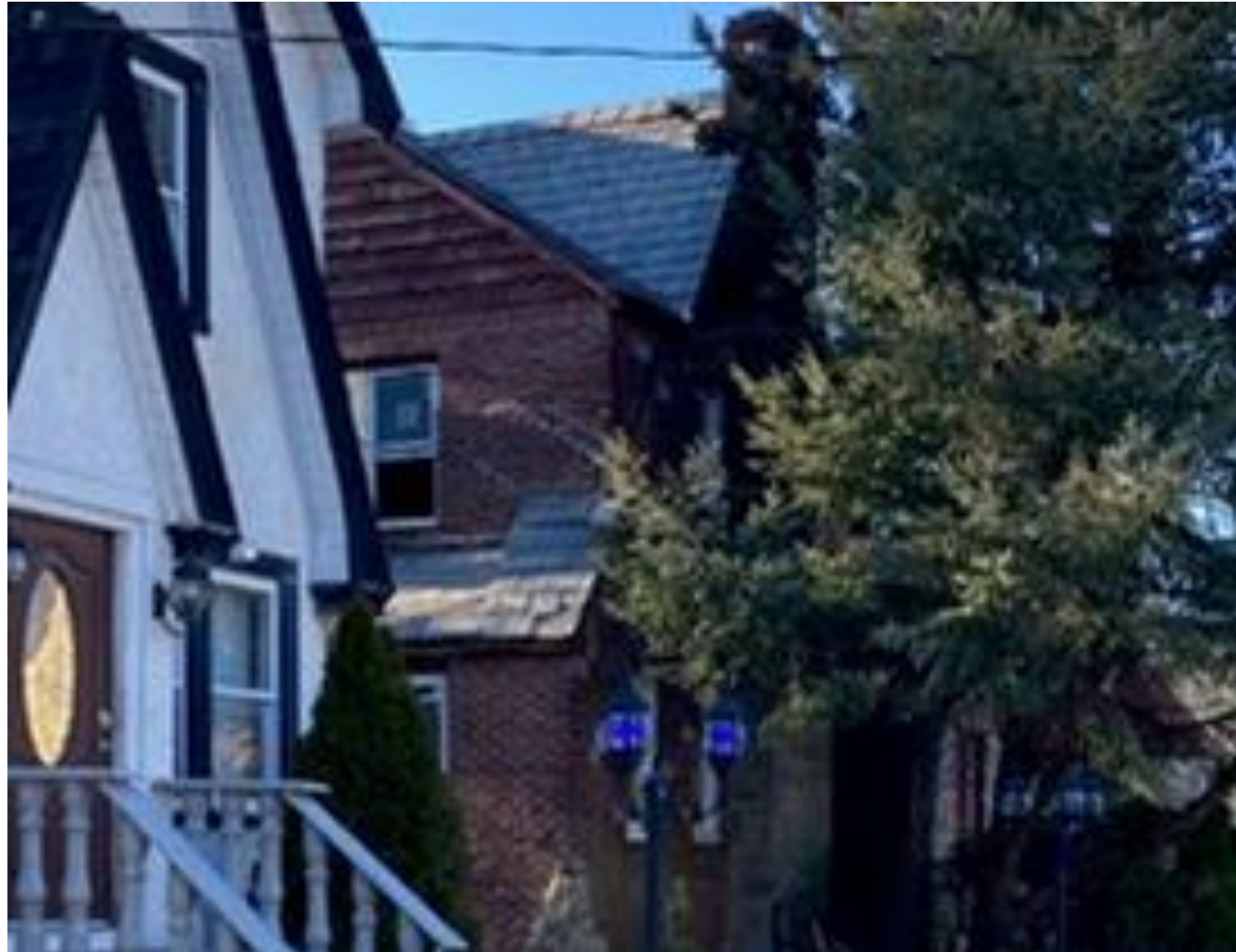
February 15, 2023 Conditions