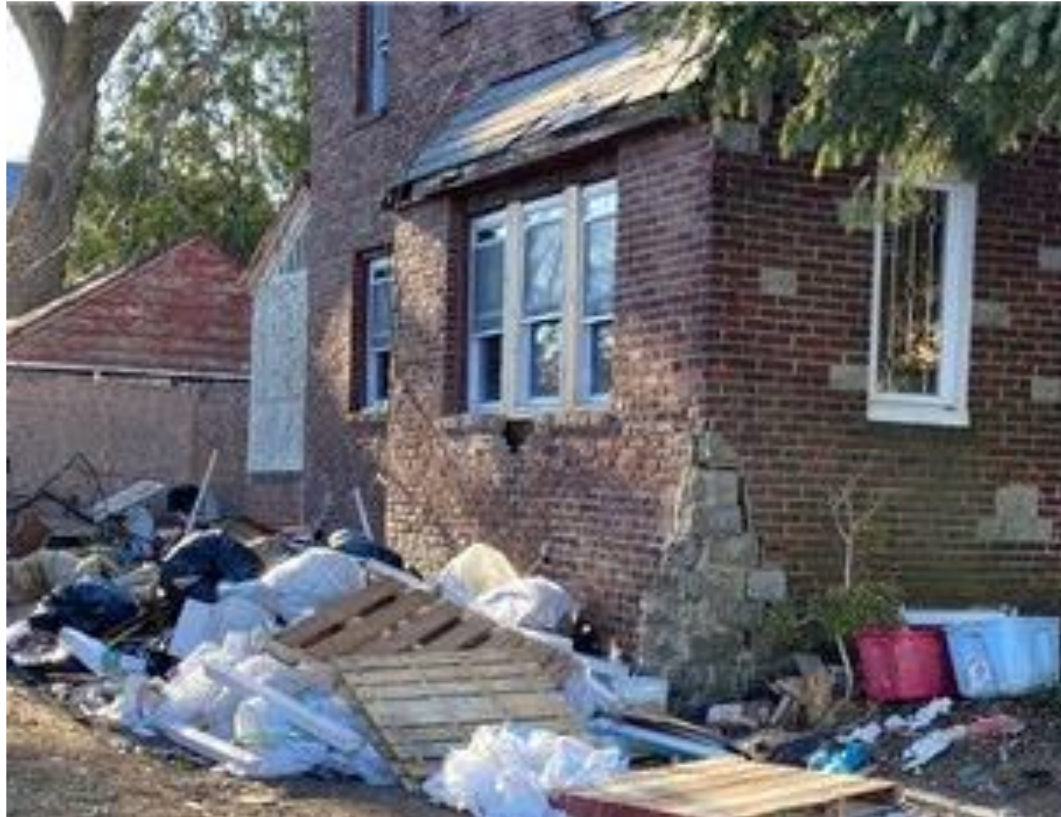
August 2024 Conditions