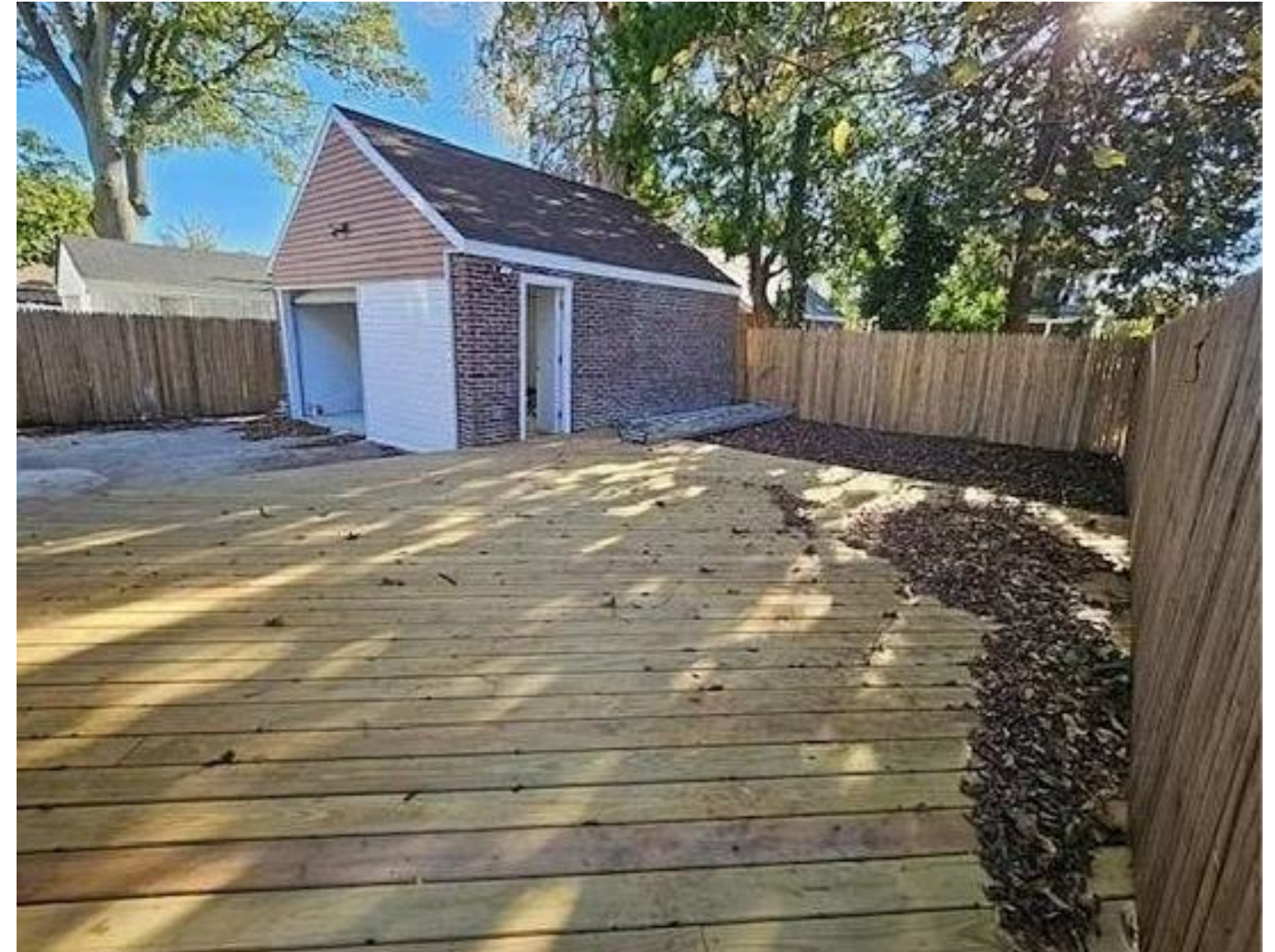
August 2024 Conditions

We would like to legalize the changes that were made