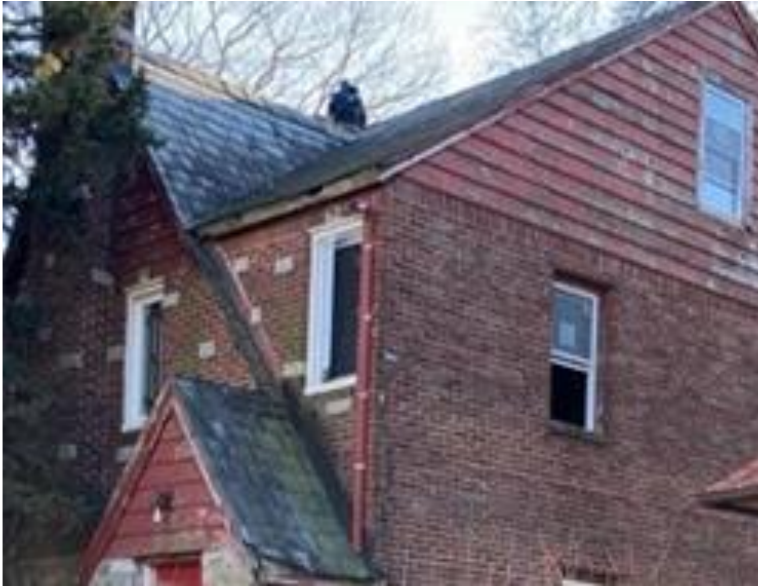
February 15, 2023 Conditions