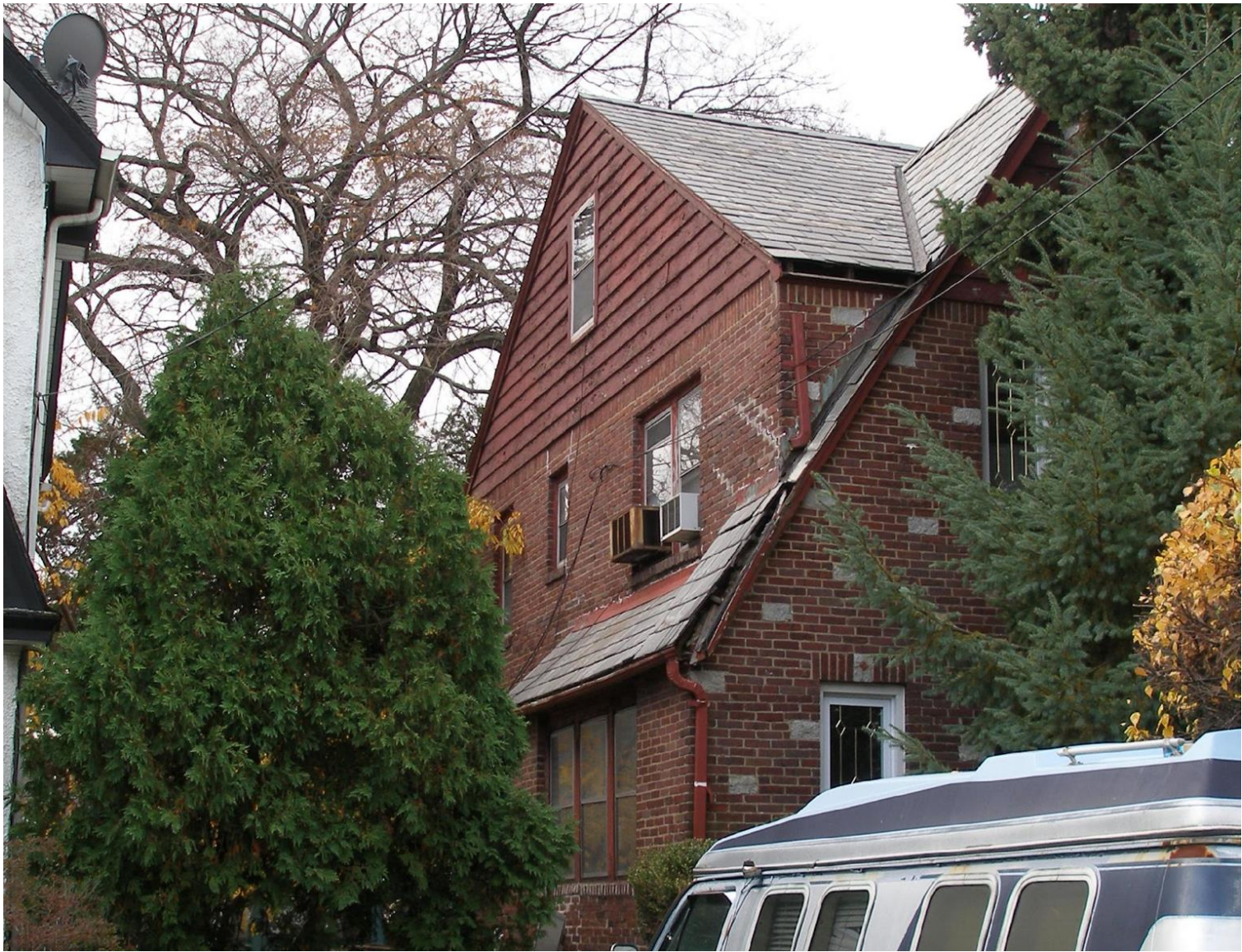
Designation Photo (2011)