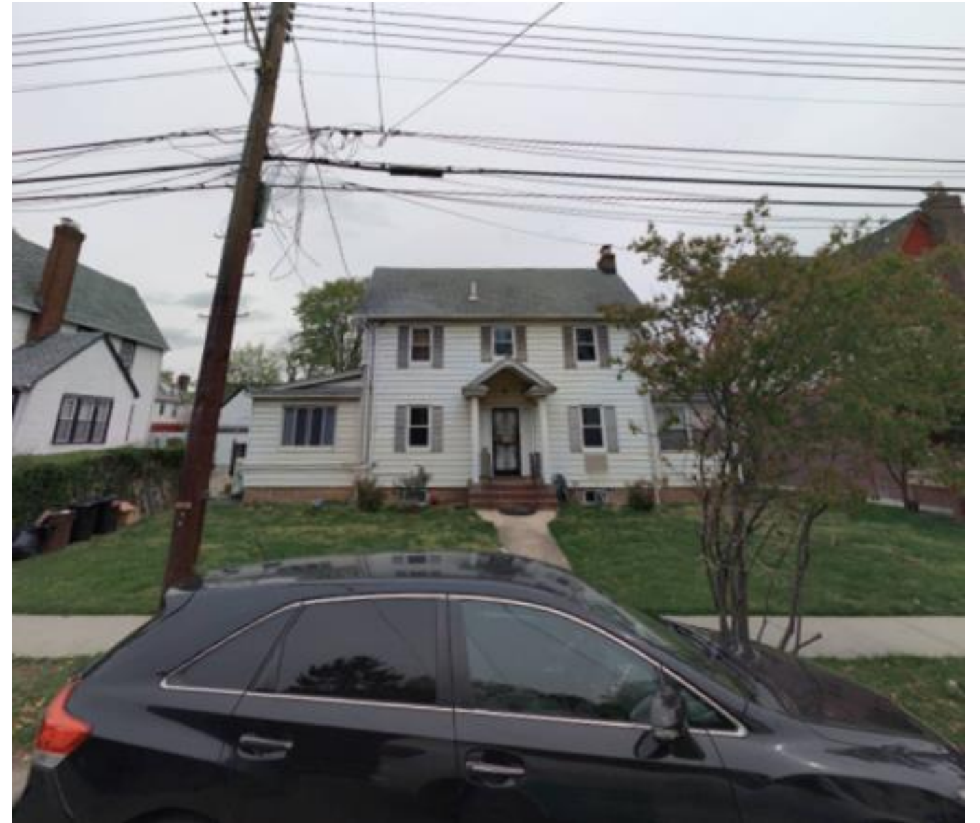
North of 114-18 179 th Street