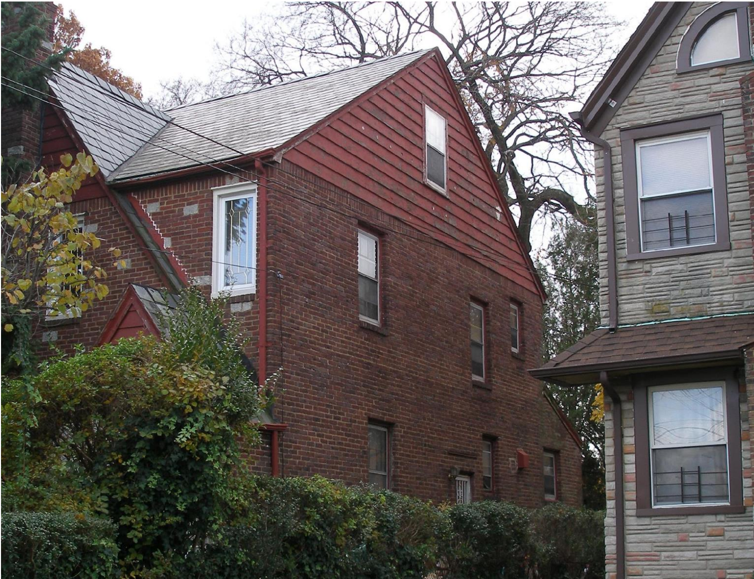
Designation Photo (2011)