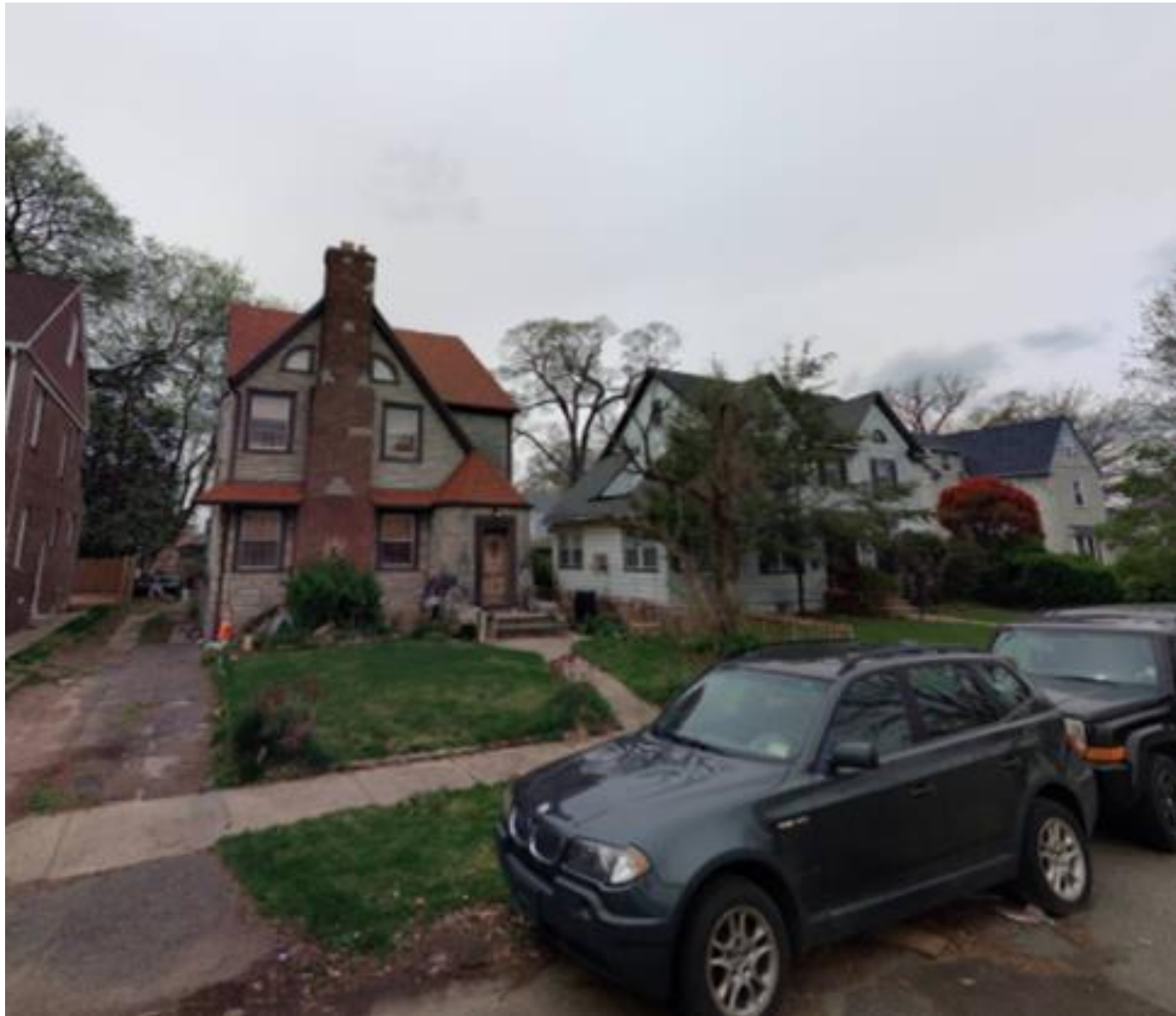
West of 114-18 179 th Street