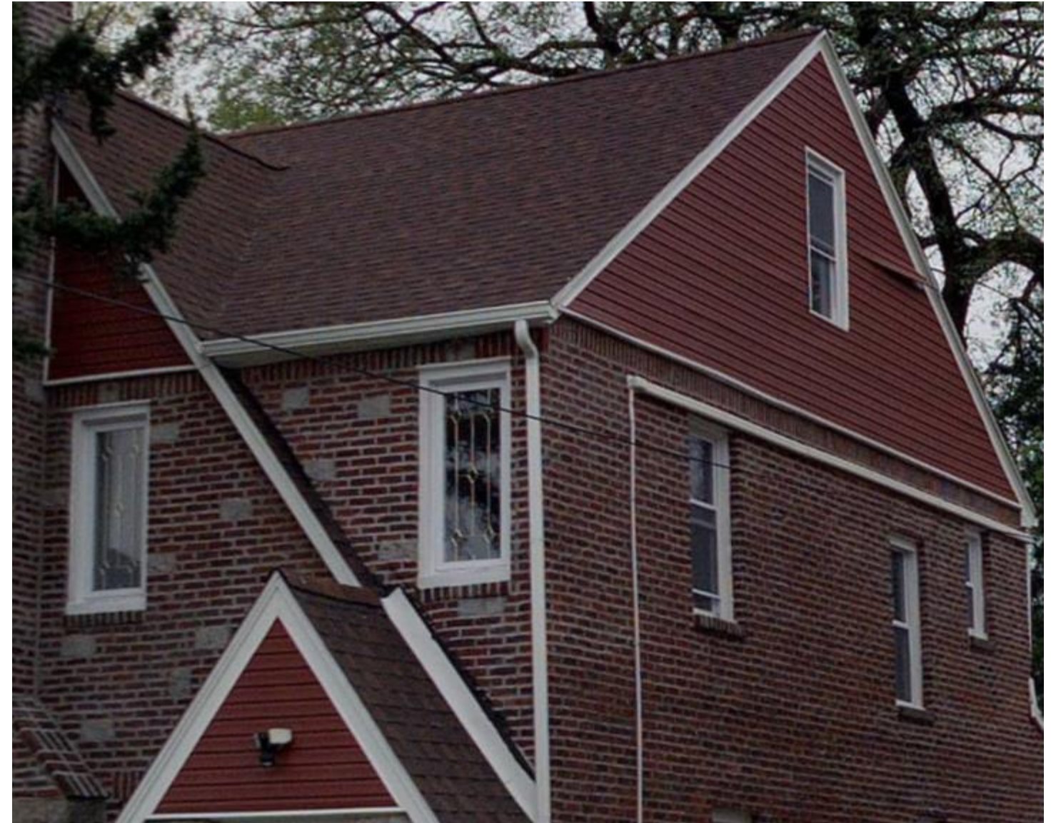
April 21, 2024 Conditions

Due to damages to previous roof . We would like to legalize the changes that were made