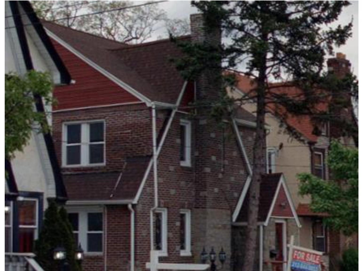
April 21, 2024 Conditions

We would like to legalize the changes that were made