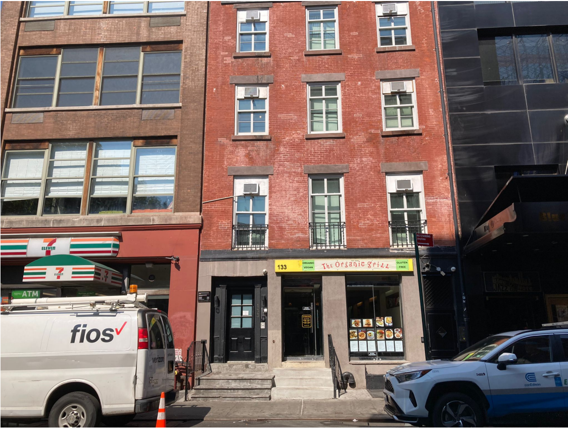
Existing conditions on 133 West 3 rd Street