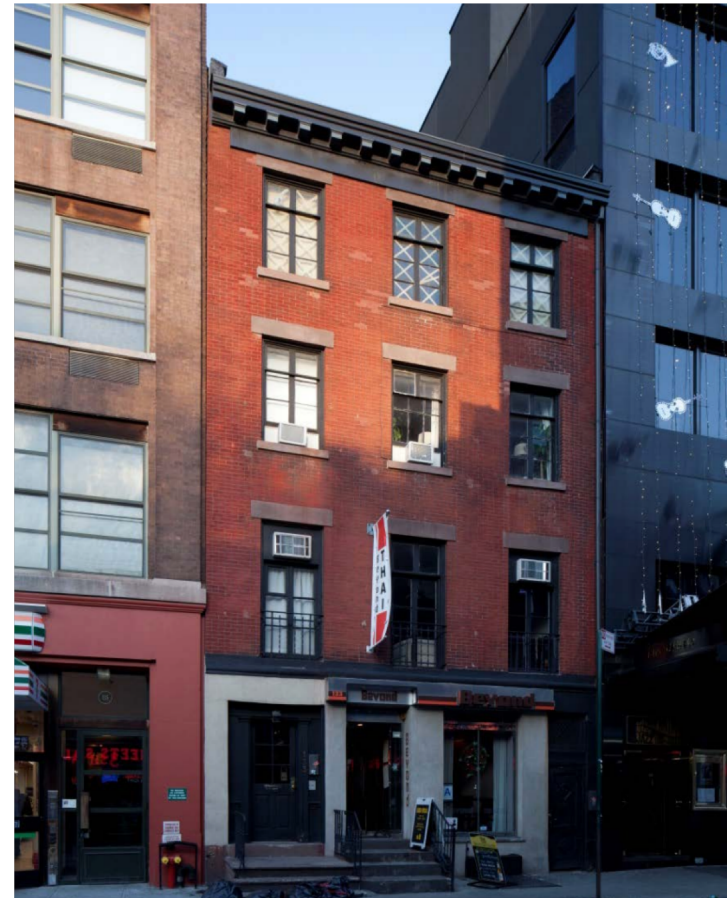
Conditions at time of designation