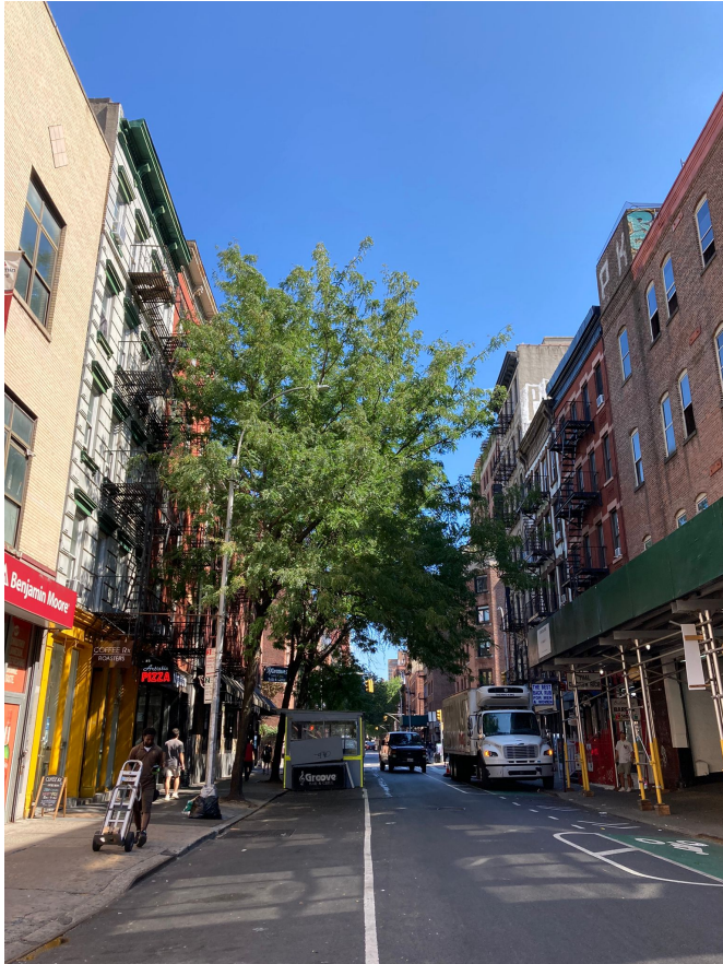
West 3 rd Street