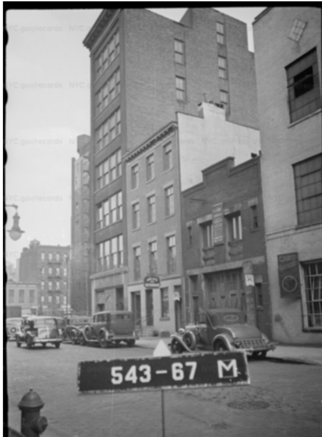
Tax photo (1940s)