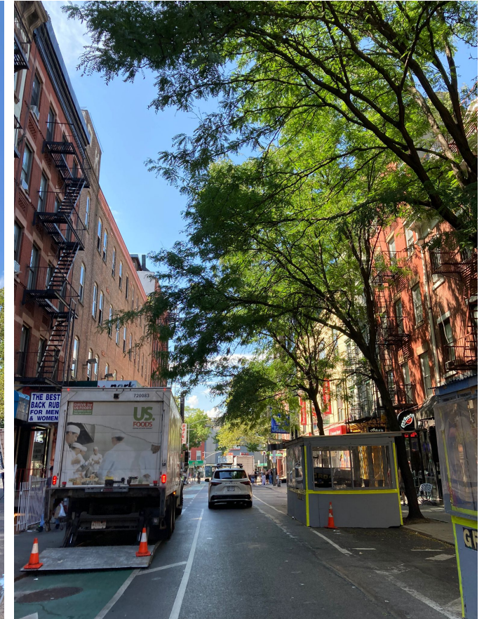
West 3 rd Street