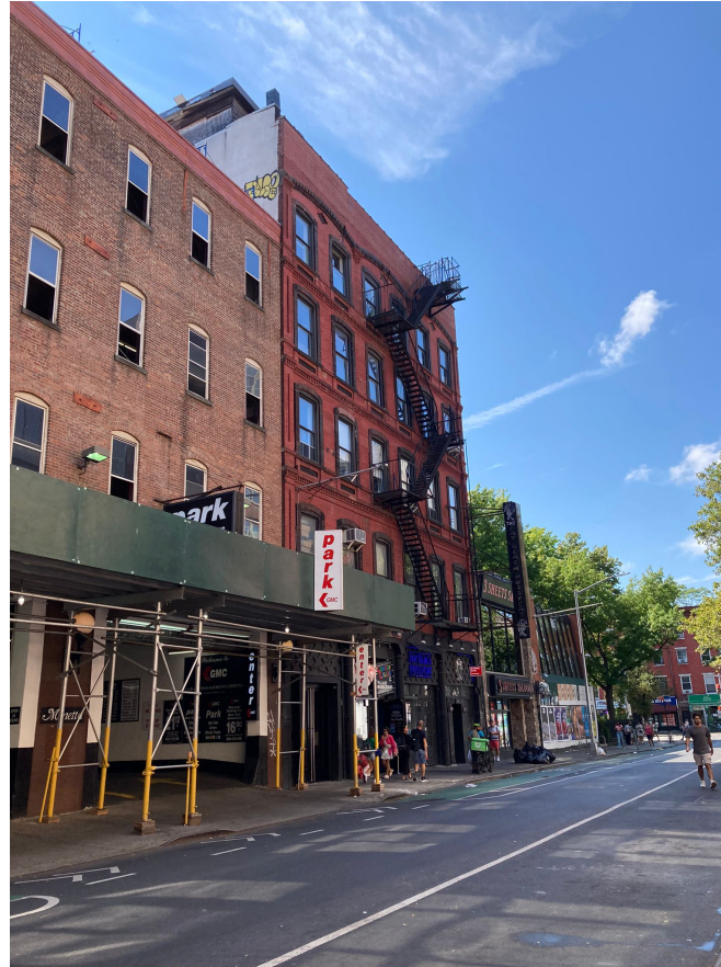
West 3 rd Street