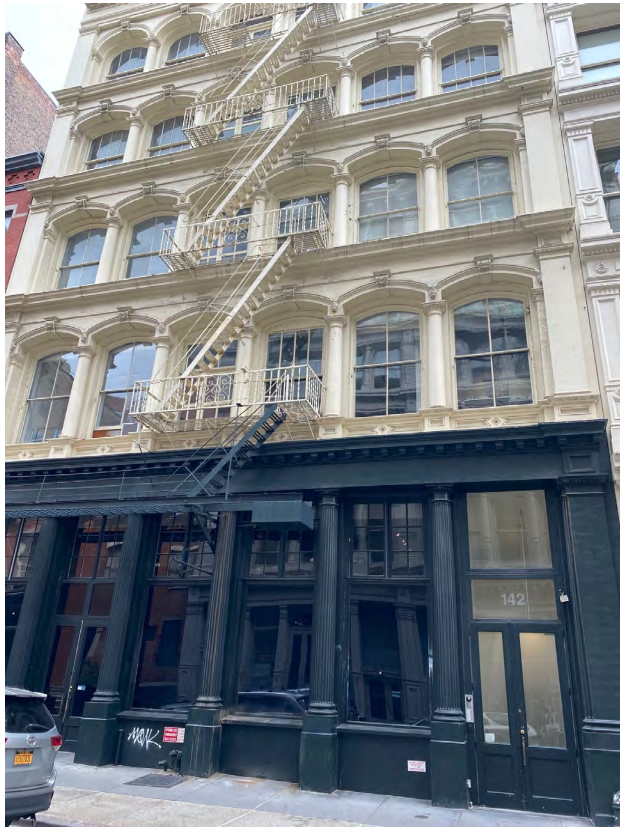
142 Greene Street New York