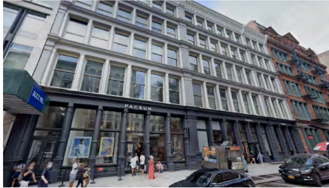
503-511 Broadway New York