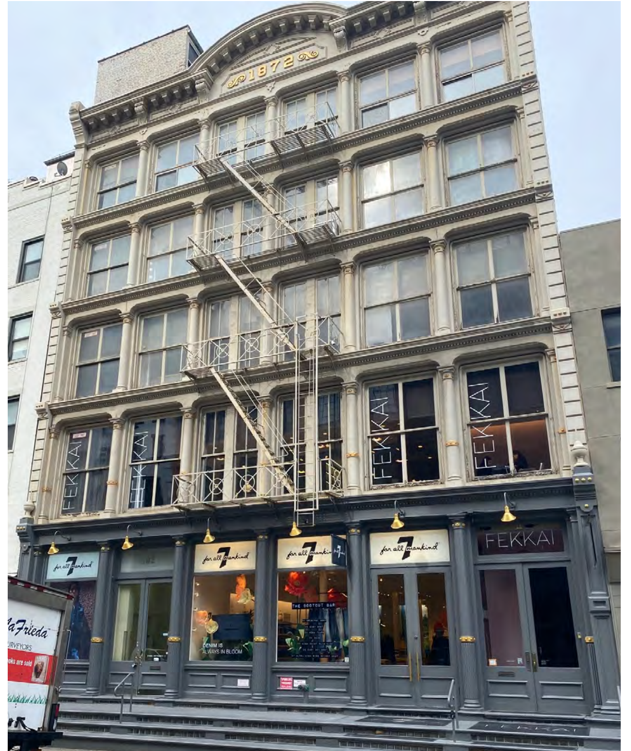
RE.FURBISHED SEPT 2, 2022