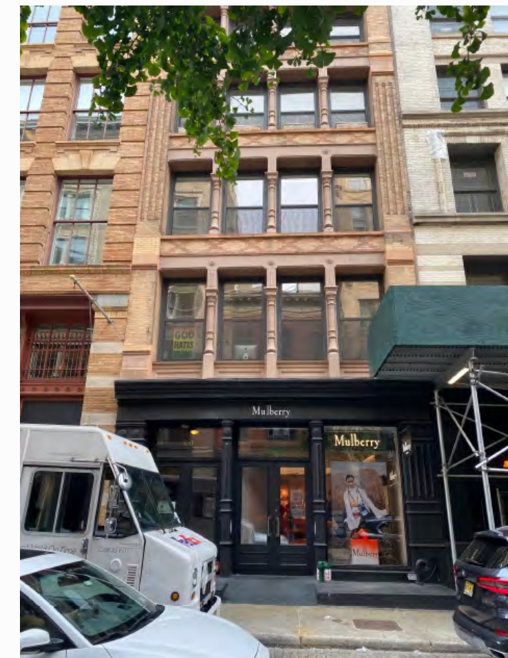
100 Wooster Street ,New York

Other relevant examples of façade painting in Cast Iron SOHO District