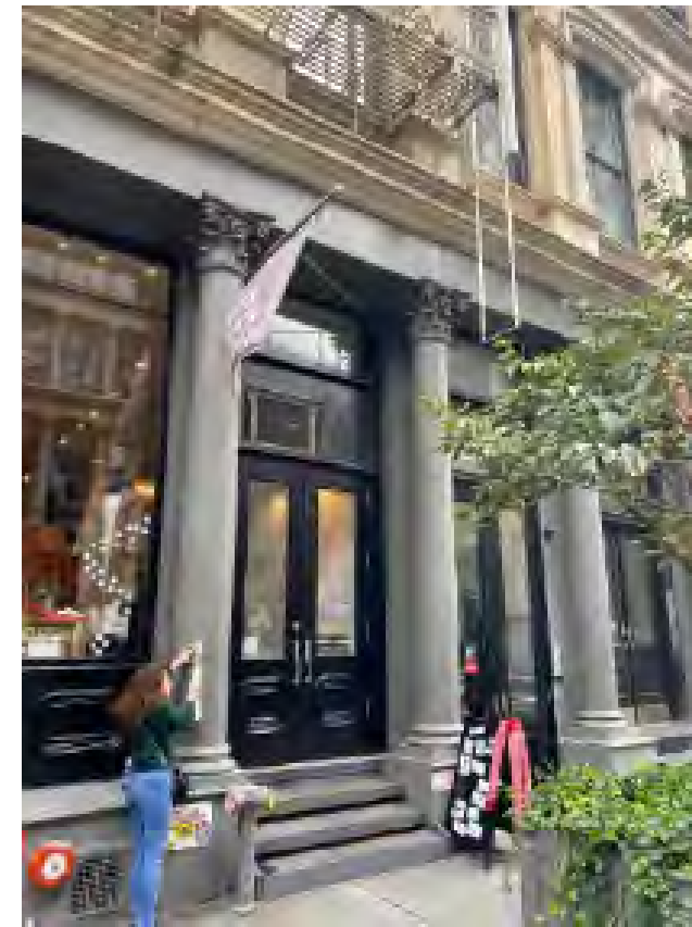
456 Broome Street