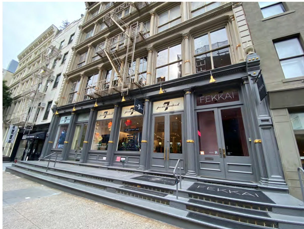
ACTUAL PHOTOS SEPTEMBER 30, 2022