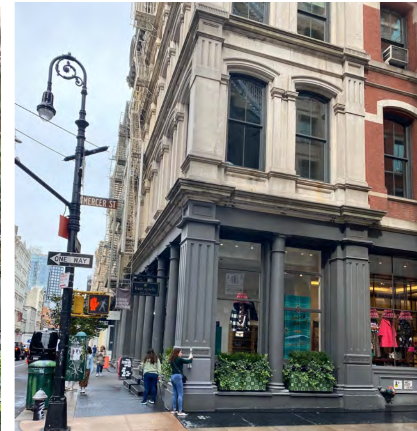
NORTH WEST CORNER OF BROOME AND MERCER