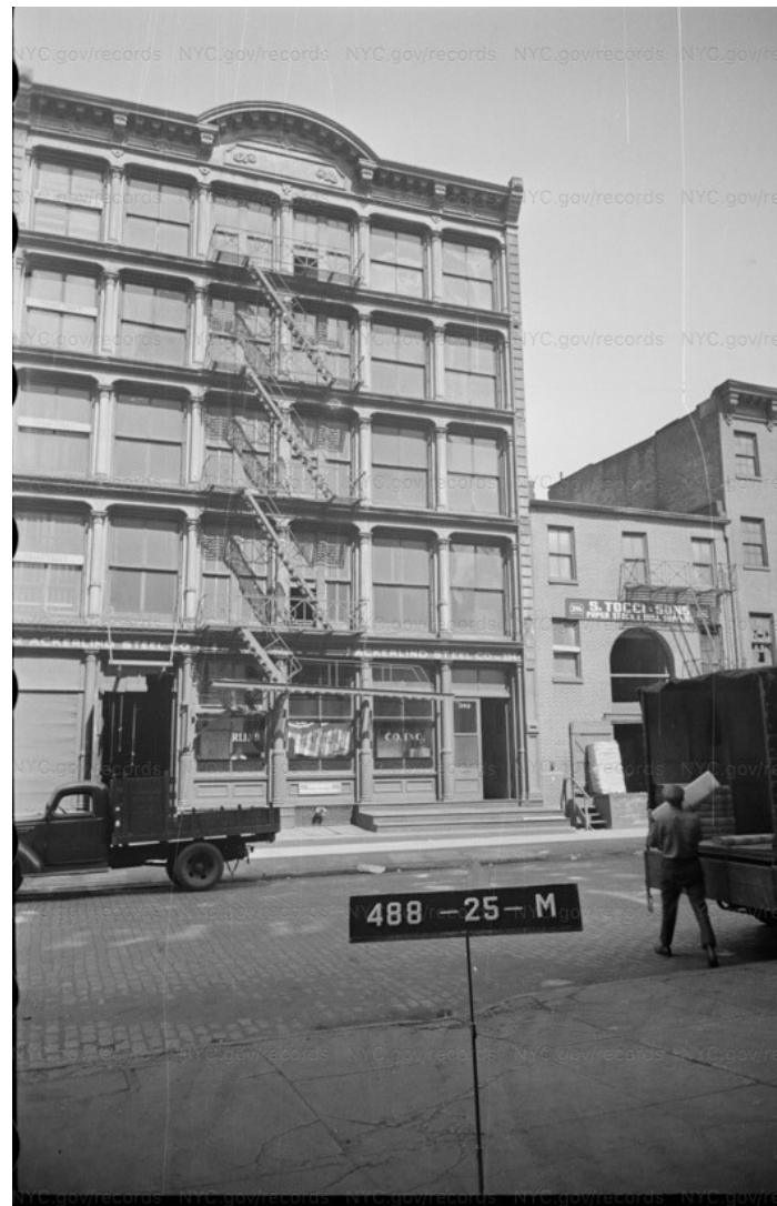
EXISTING – Historic Tax Photo