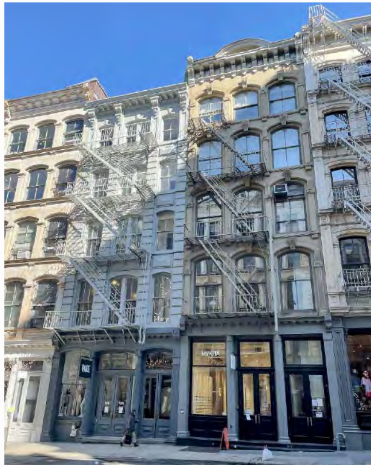
458 Broome Street 460 Broome Street