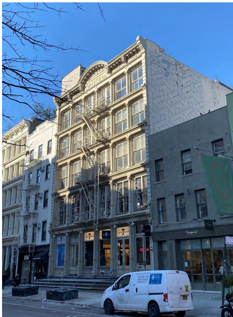
EXISTING – PRESENT DAY