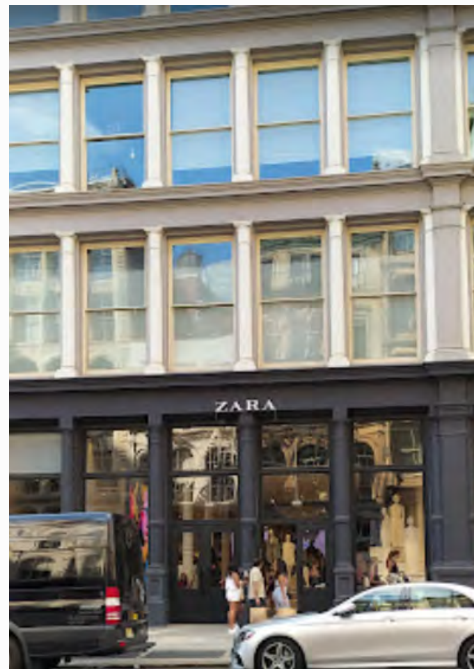
503 Broadway , New York