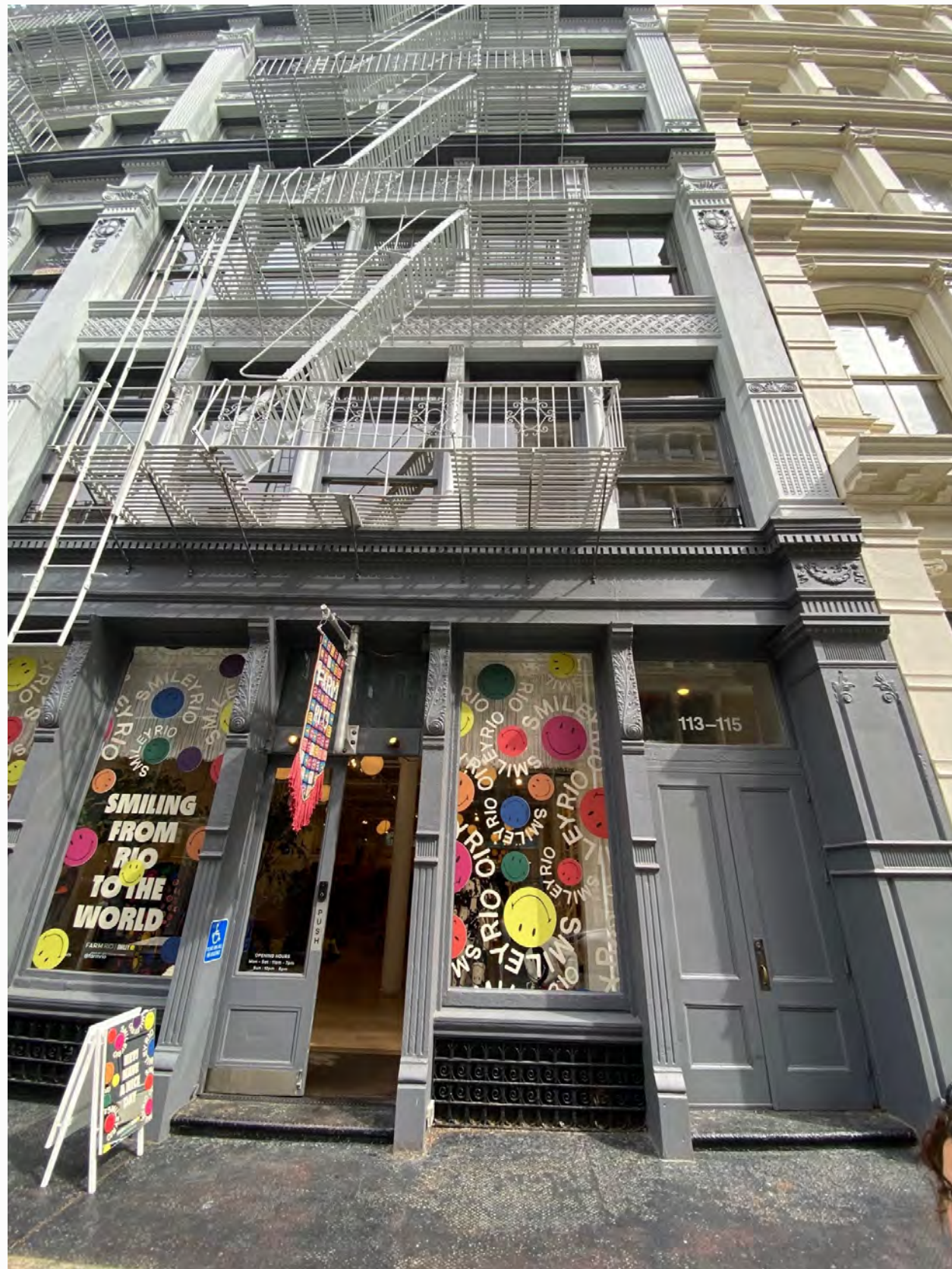
113 Prince Street New York NY