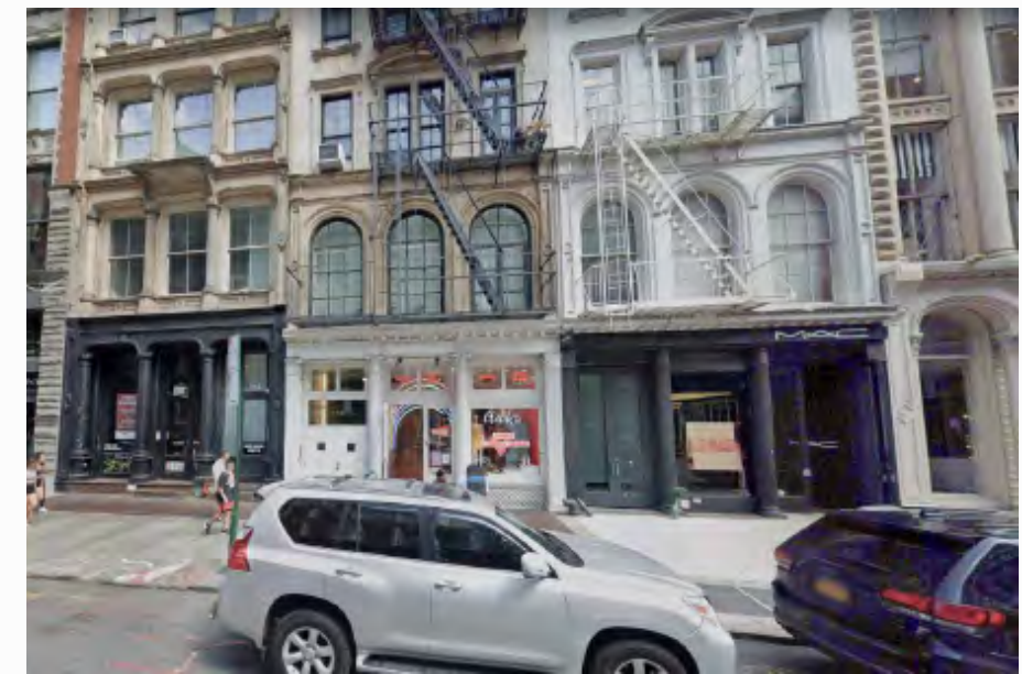
508 Broadway - 510 Broadway - 512 Broadway