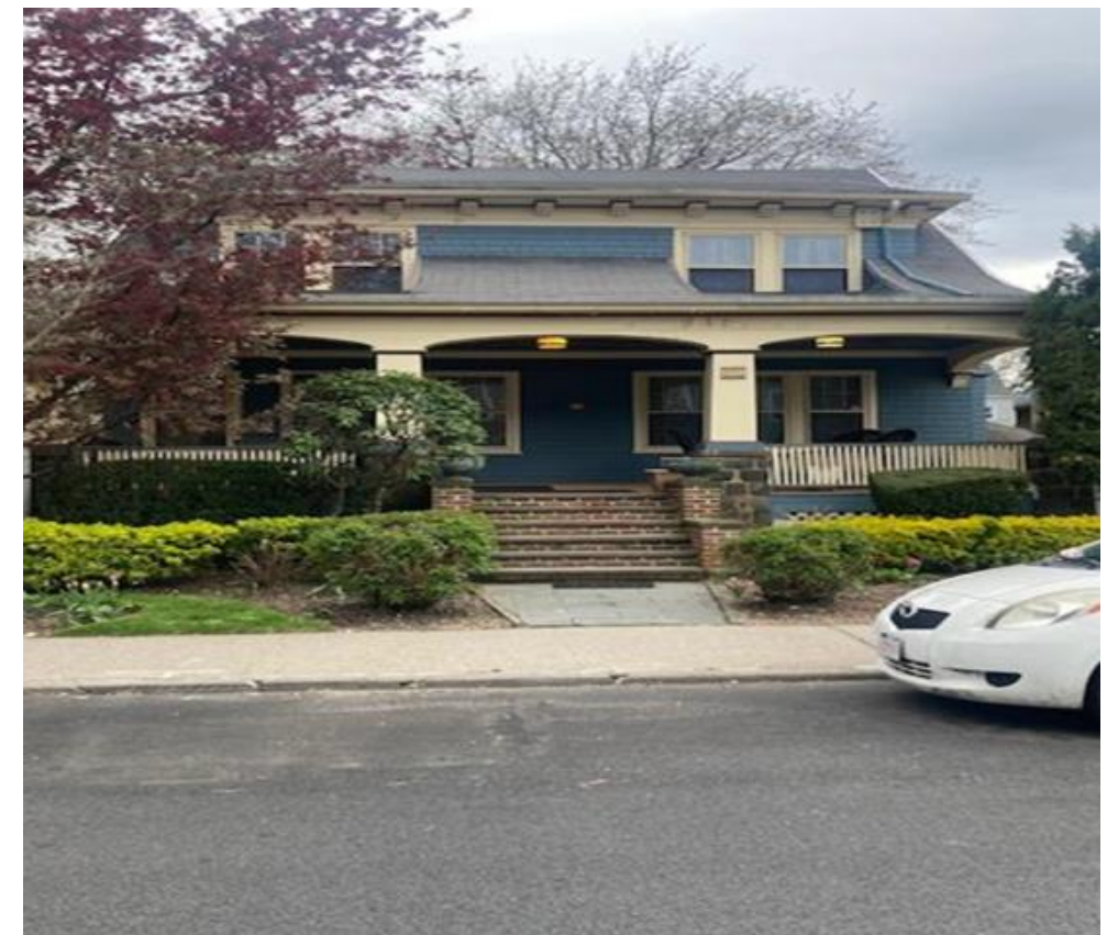
490 E. 16 th Street