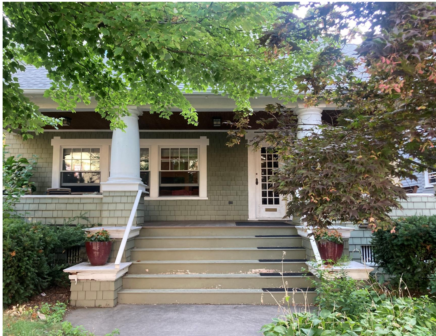
Existing wood stairs

Replace existing wood entrance stairs with brick and bluestone entrance stairs