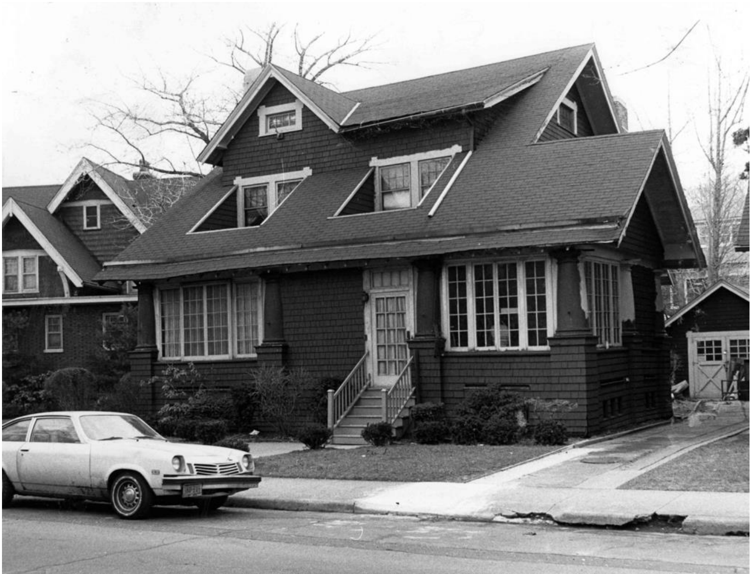
LPC Designation Photograph