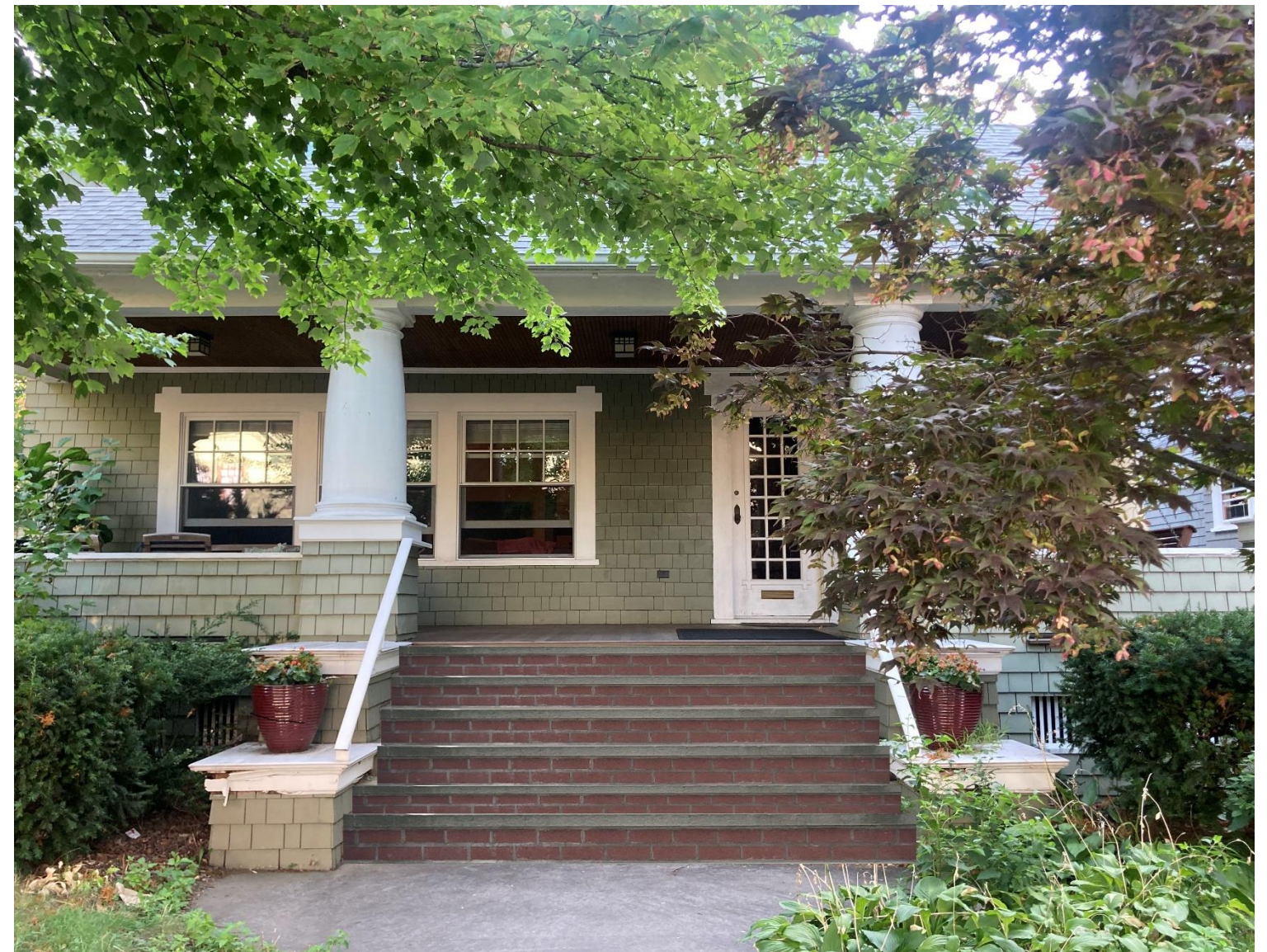
Proposed brick and bluestone stairs