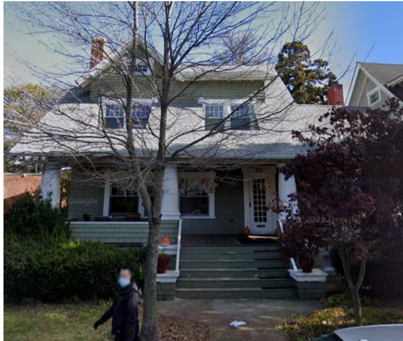
View from 16 th Street of the subject property