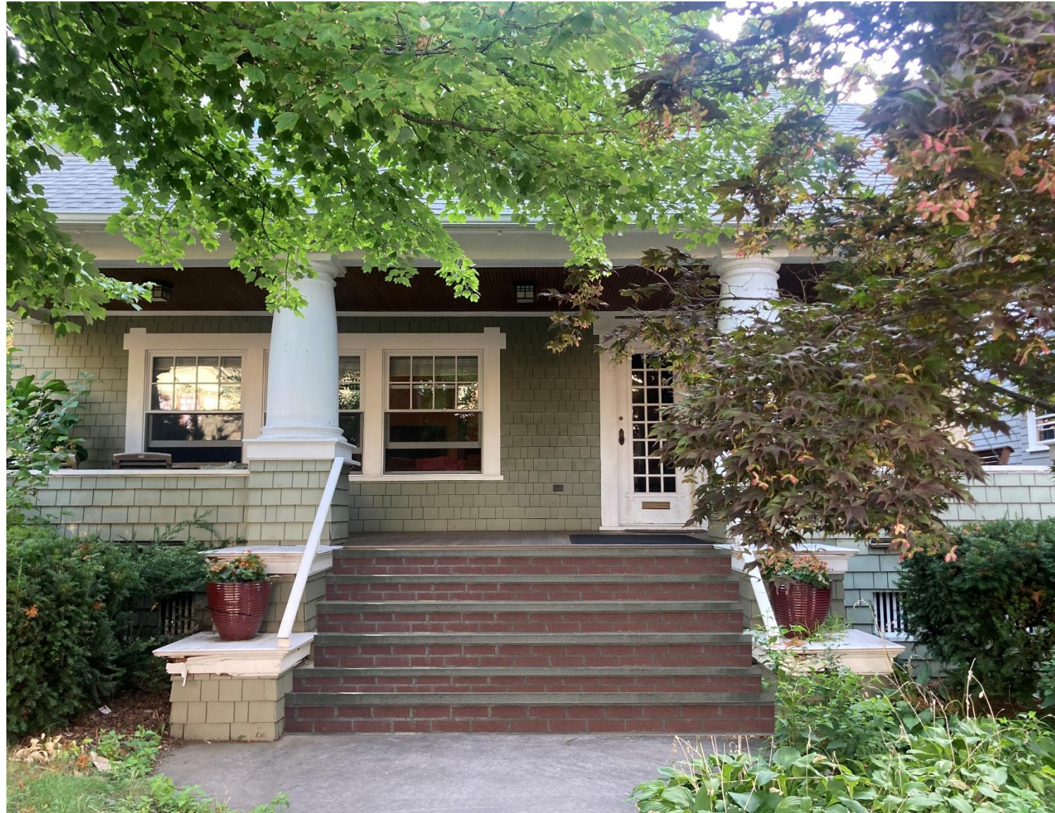
Proposed change to stairs - Replace wood with brick and blue stone