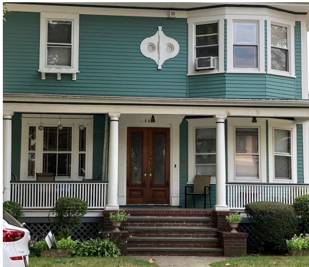
462 E. 16 th Street