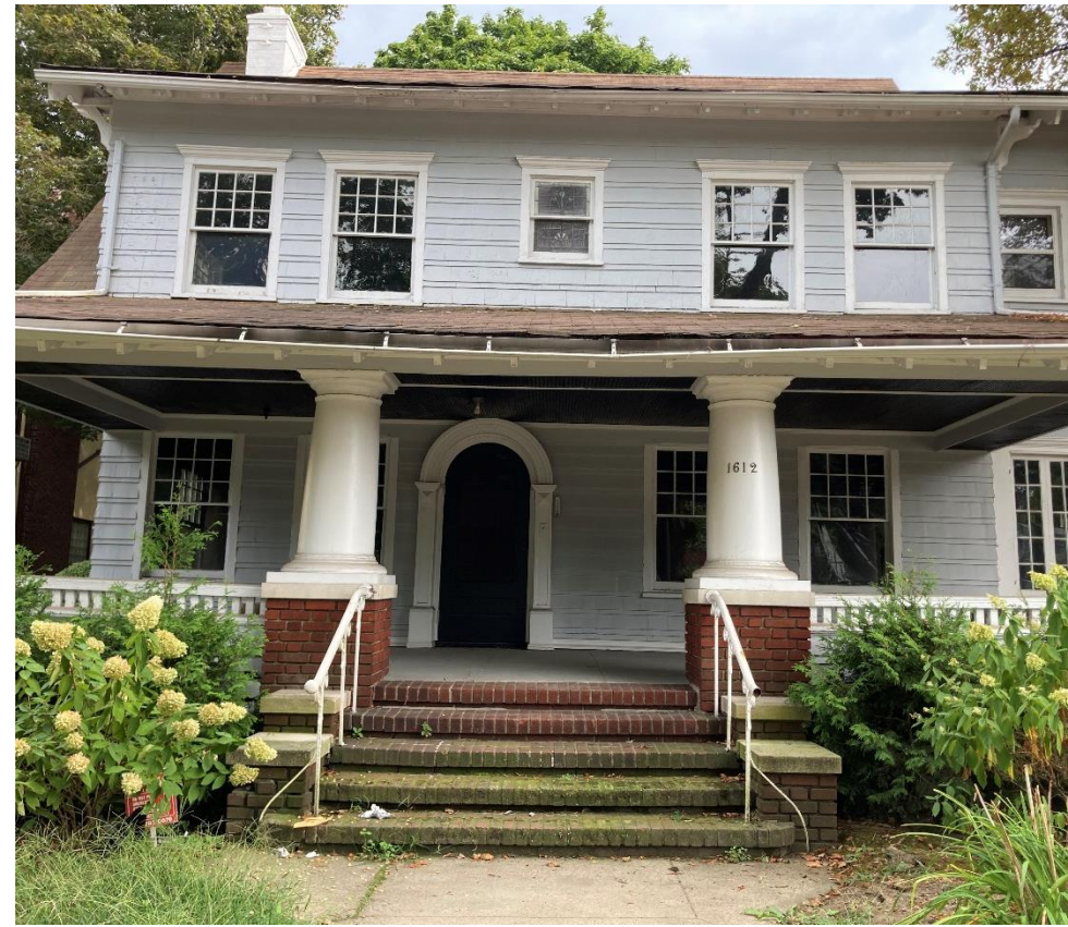
1612 Ditmas Avenue