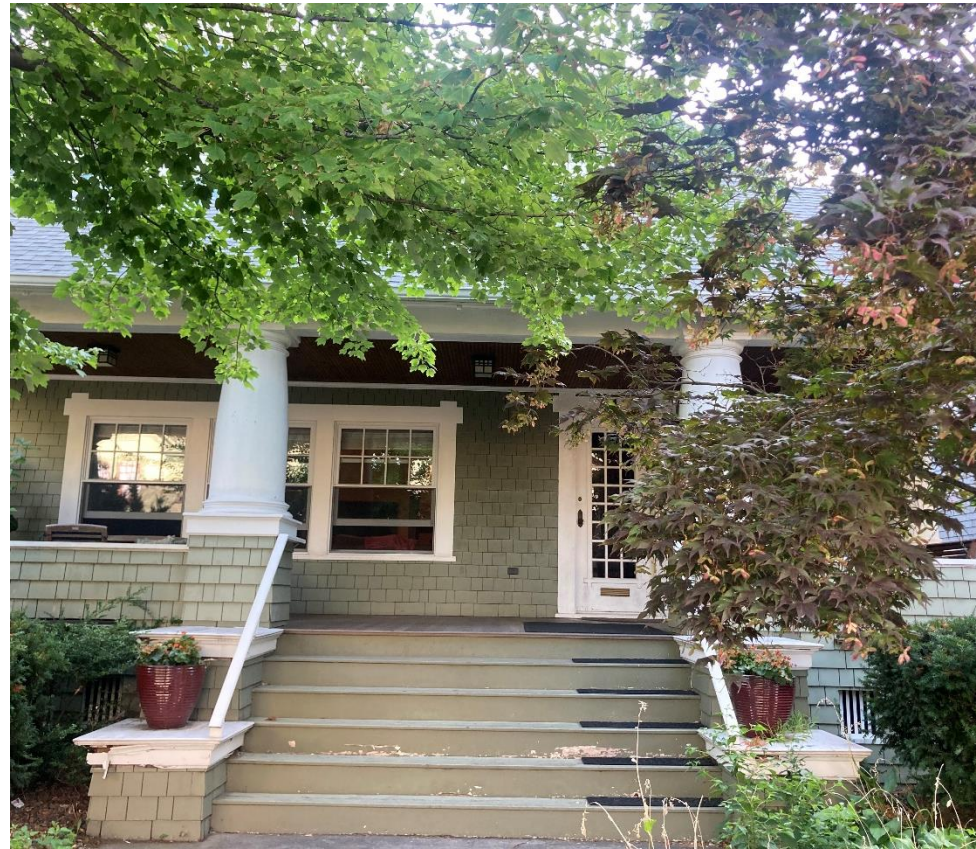
511 East 16 th Street looking east