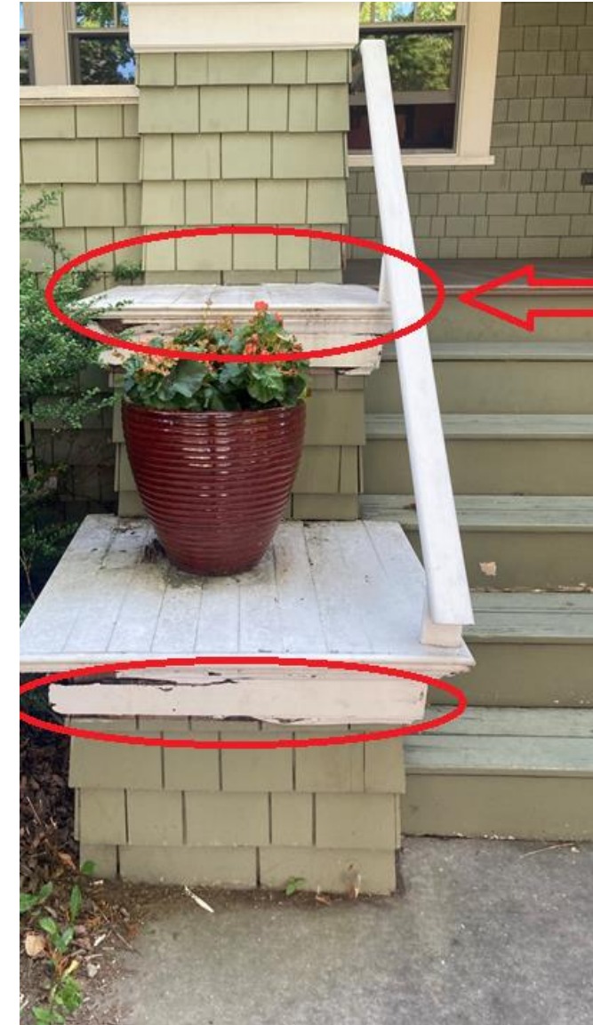
Proposed change to cheek walls – Maintain shingled base and banister but replace top with white composite wood