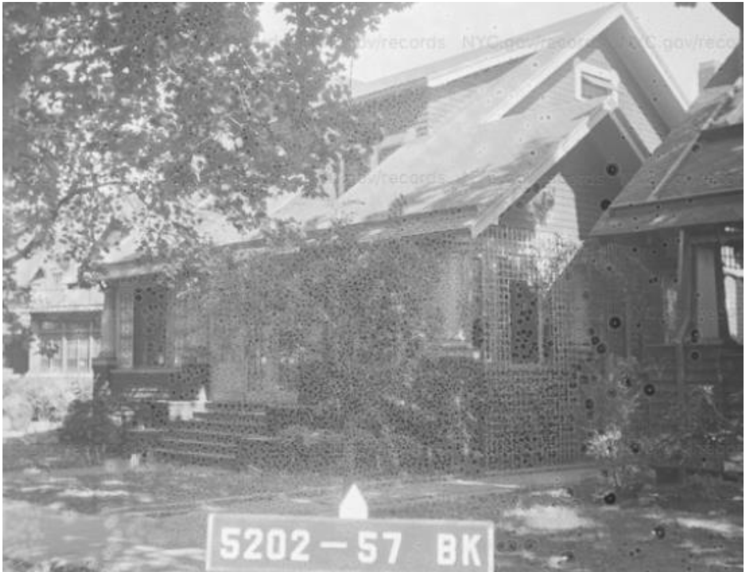
1940's Tax Photograph