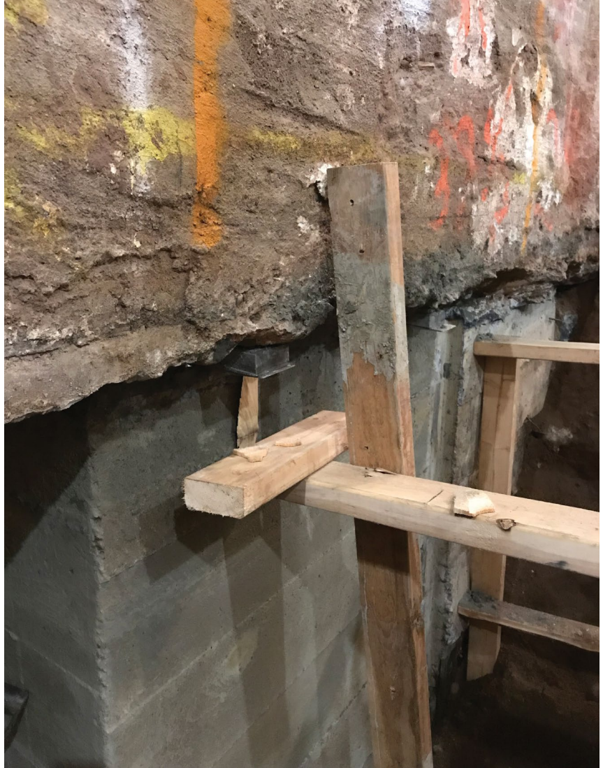
Underpinning in progress at the foundation wall of a historic building.

If the work does not require underpinning or only requires limited underpinning and does not occur at or adjacent to designated buildings under the categories described above, facade monitoring is not required.