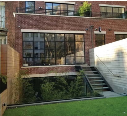
Excavation can be approved in a rear yard to accommodate a sunken terrace.

At least a five-foot wide unexcavated planting area is maintained along the rear lot line.