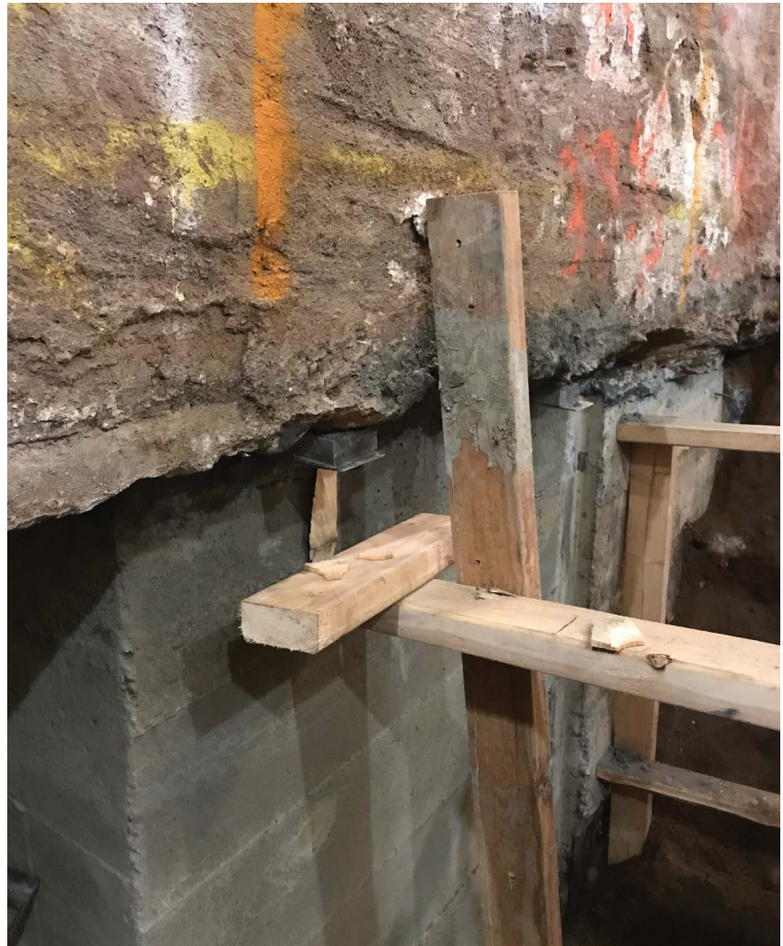
Underpinning in progress at the foundation wall of a historic building.

For proposals with major excavation, LPC staff in some situations will initiate enhanced engineering review of these documents with referrals to LPC's consulting structural engineer and/or the NYC Department of Buildings (DOB). See the " Major Excavation and Structural Work " fact sheet for more information.