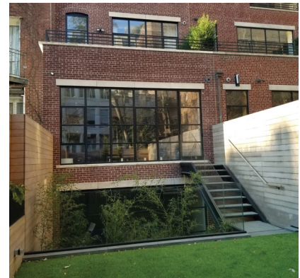
Excavation can be approved in a rear yard to accommodate a sunken terrace.

At least a five-foot wide unexcavated planting area is maintained along the rear lot line.