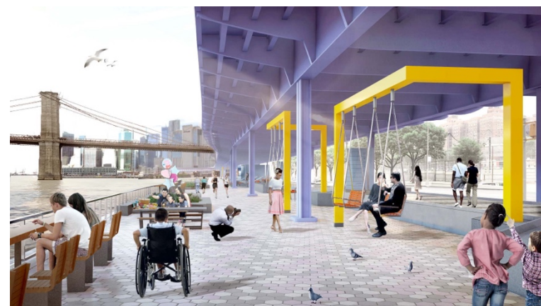
Rendering of Esplanade between Catherine Slip and Market Slip