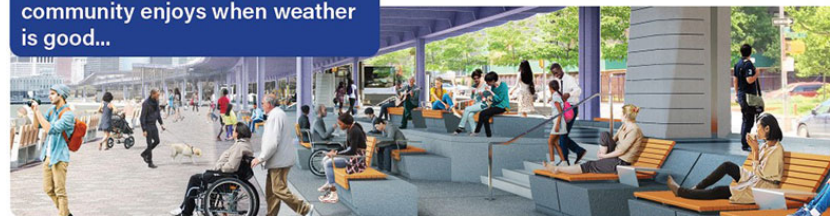
Rendering of Catherine Slip Esplanade