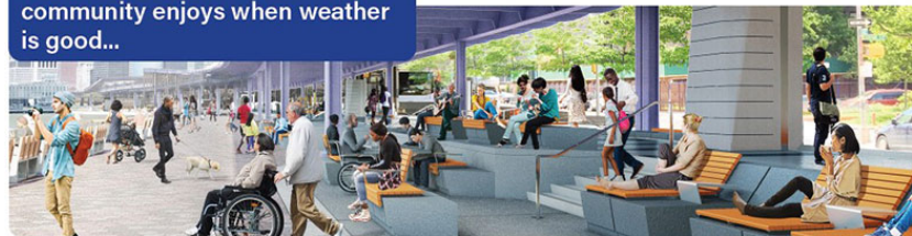
Rendering of Catherine Slip Esplanade