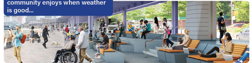
Rendering of Catherine Slip Esplanade