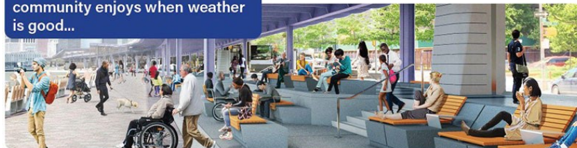
Rendering of Catherine Slip Esplanade