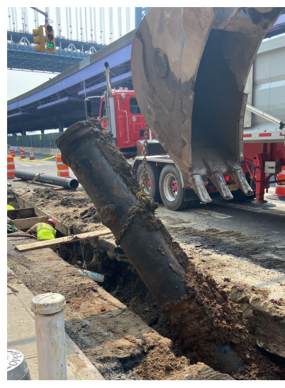
Water main removal