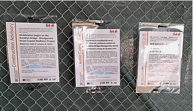
Advisories posted on-site