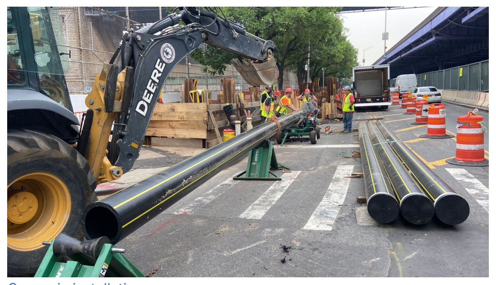
Gas main installation