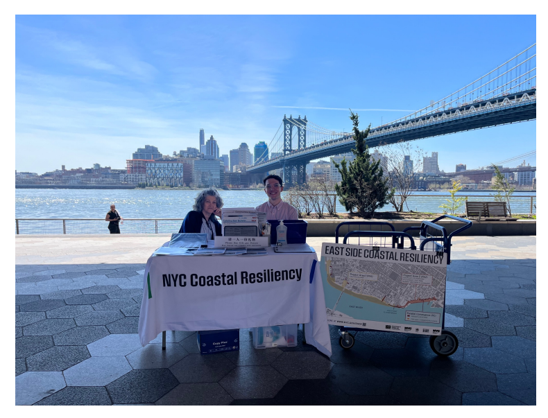
Tabling event April 12, 2023