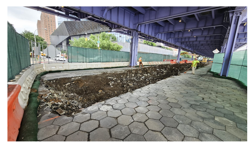
Excavation for floodgate foundation