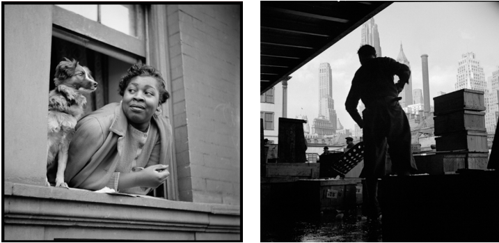
Harlem Resident with Dog, ca. 1943 (Left) Fulton Fish Market, 1940 (Right) Gordon Parks Gelatin Silver Print

Gordon Parks (1912-2006) was a pioneering and now legendary African American photographer, first recognized in the 1940s with a Federal Security Administration commission to record the lives of men and women too often ignored. This early documentary work soon led to art photography and, in the 1960s onwards, to filmmaking. These two Parks photographs depict ordinary people in everyday circumstances: a woman surveys the street with her elbows comfortably on the windowsill; a worker unloads the catch in the early morning fog of Fulton Fish Market.