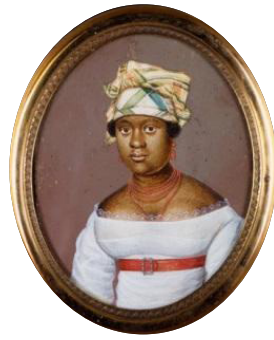
Juliet Noel (Mrs. Pierre) Toussaint