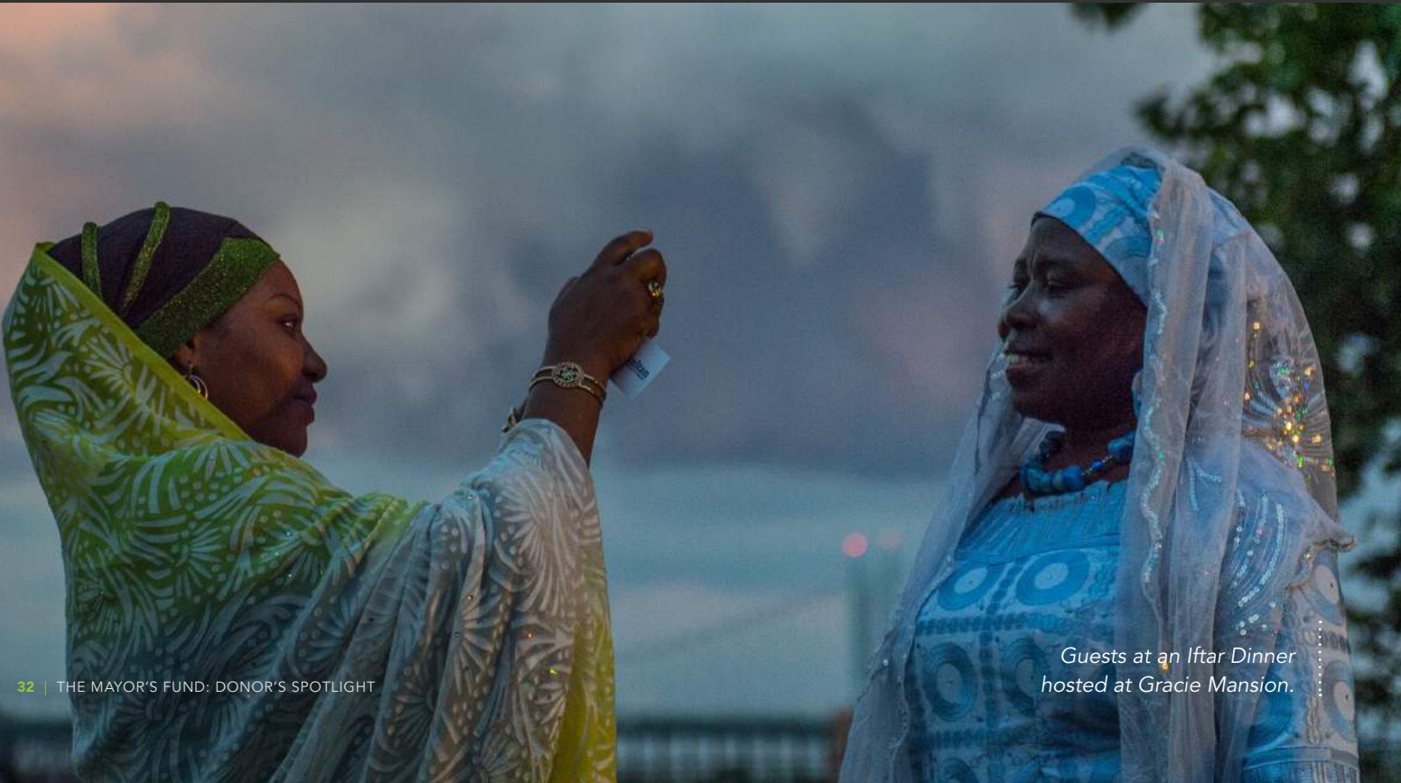
Guests at an Iftar Dinner hosted at Gracie Mansion.

The Sandy Temporary Rental Program operates in conjunction with Build it Back’s Temporary Relocation Assistance program, which provides rental reimbursement for homeowners relocated for at least a month due to construction. The new program targets vulnerable and under-resourced homeowners who demonstrate an additional need for assistance with upfront housing expenses.